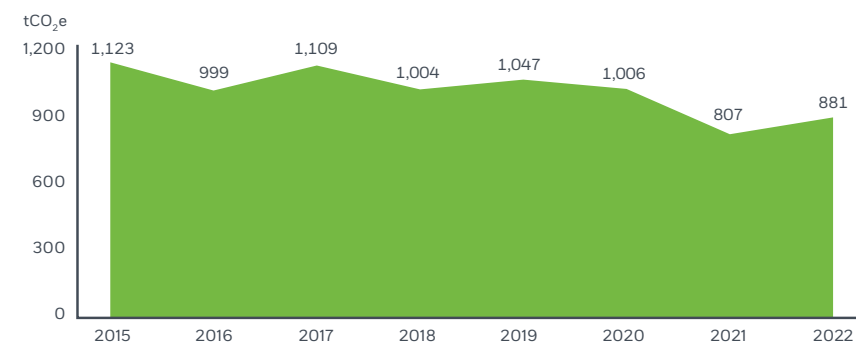
GHG Inventory Activity Data t CO 2 e