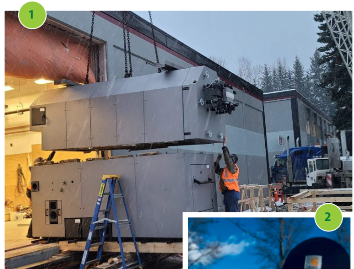
Figure 1. A biomass boiler has been installed at Silver King Campus.

In 2021, the City of Nelson installed Level 2 charging stations at both the Silver King and Tenth Street campuses, putting Selkirk College on the electric vehicle charging network map. In the coming year, two additional Level 2 charging stations