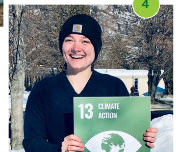
Figure 4. By reducing our greenhouse gas emissions, we are contributing to Sustainable Development Goal 13: Climate Action.

role in achieving the SDGs, and by signing SDG Accord, have committed to deliver the goals, report on our progress and share knowledge and learning with others worldwide.