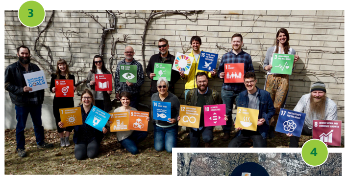
Figure 3. Selkirk College is a proud signatory of the SDG Accord and is making progress on the Global Goals.

Selkirk College was the first post-secondary institution in Canada to sign the SDG Accord, the university and colleges response to the United Nations Sustainable Development Goals (SDGs). We recognize our central and transformative