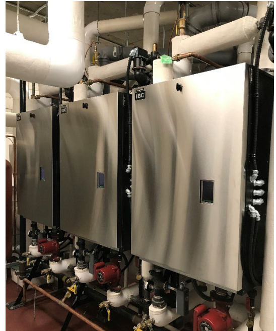
New boilers at Norquay Elementary School

The District has participated in several activities that reduce GHG emissions in the community that are not specifically “in scope” for our carbon neutral required reporting. These typically focus on active transportation such as bike to school week events, corporate membership in Vancouver’s bike share program, and supporting schools on school active travel planning to reduce congestion and improve active commuting to and from school sites.