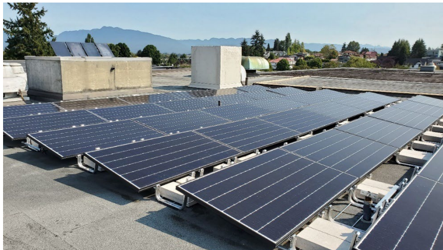
Solar Panels at Tupper Secondary School

The Province has defined criteria for reporting and has developed a web-based system for tracking and reporting emissions.