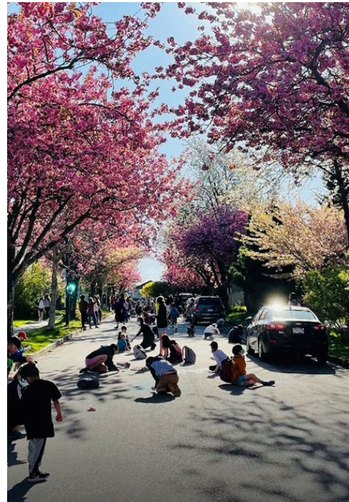
Students enjoy a School Street