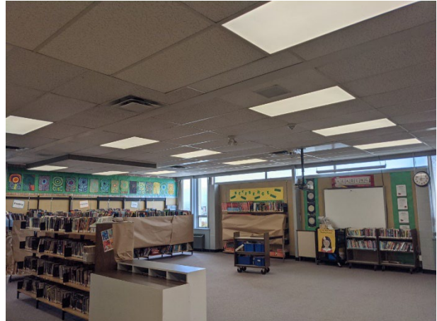
Before and After: Lighting retrofit at Bruce Elementary School

The District has taken several steps to reduce emissions related to paper consumption, including: