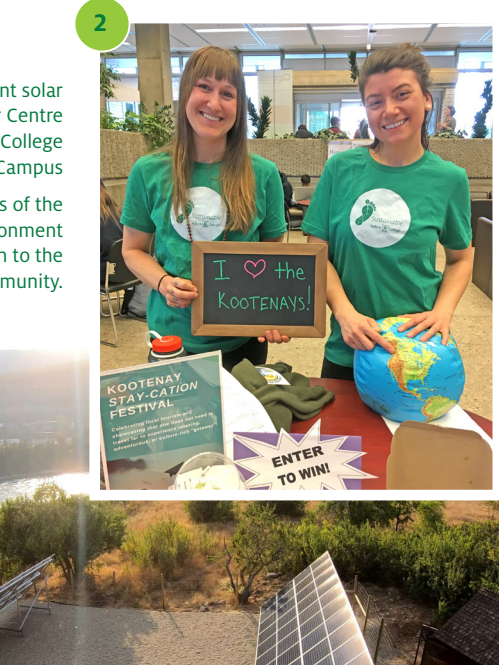
Figure 2. Members of the student-based Environment Club provide outreach to the campus community.

Figure 1. Ground mount solar installation near the Mir Centre for Peace at Selkirk College Castlegar Campus