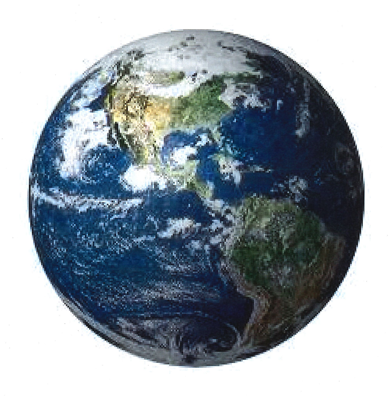
School District No.54 (Bulkley Valley)