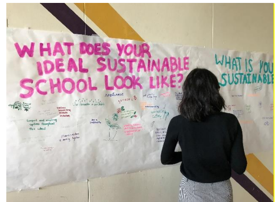
VSB student-created Sustainability Conference