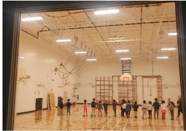
New LED Lighting installed at an elementary school

The District has taken several steps to reduce emissions related to paper consumption, including: