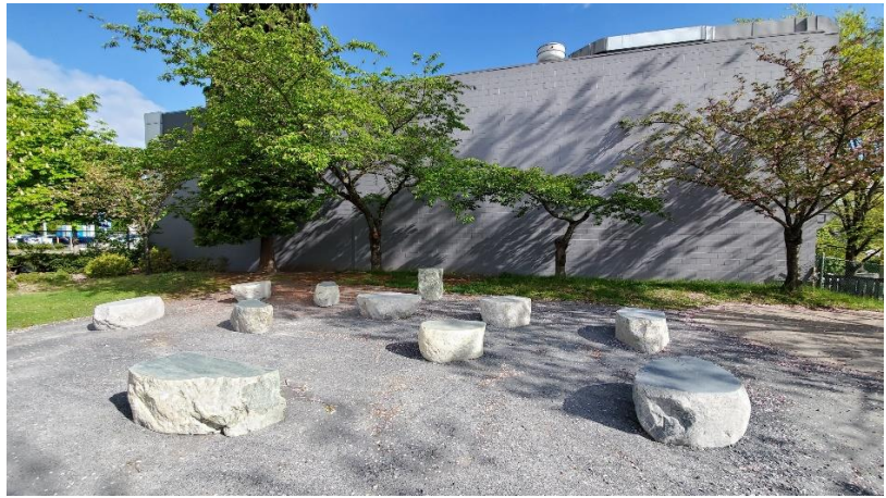
A new outdoor learning area installed at Brock Elementary

The VBE has participated in several activities that reduce GHG emissions in the community that are not specifically “in scope” for our carbon neutral required reporting. These typically focus on active transportation such as bike to school/work week events, corporate membership in Vancouver’s bike share program, and working with the City of Vancouver’s School Active Travel Planning Program to reduce congestion and improve active commuting to and from school sites.