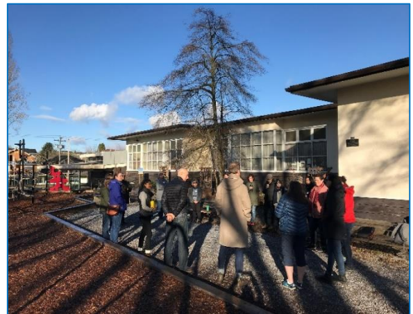
Teachers at a VSB garden Pro-D event