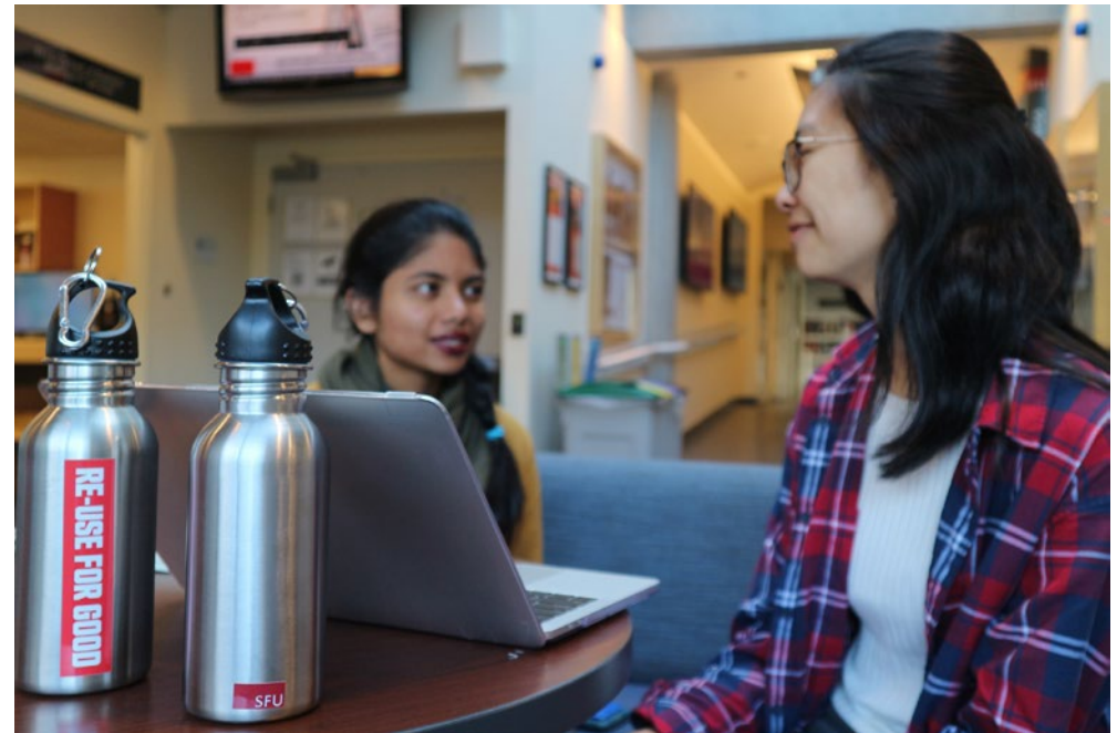
Two students pictured with Re-use for Good reusable water bottles.

Many of the existing behaviour change programs are ongoing or run on an annual basis. Sustainable Spaces will continue at all three campuses. Stakeholders will be engaged through launch events, lunch and learns, and strategic campaigns to maximize participation and GHG emissions reduction efforts. The BC Cool Campus challenge will also run again with other post-secondary institutions. Re-use for Good will continue to roll out at SFU, with planned actions including: expanding the GoGreen program, improving dishwashing infrastructure, addressing single-use coffee pods in offices and complying with the City of Vancouver plastics reductions and surcharge policies on hot and cold beverages.