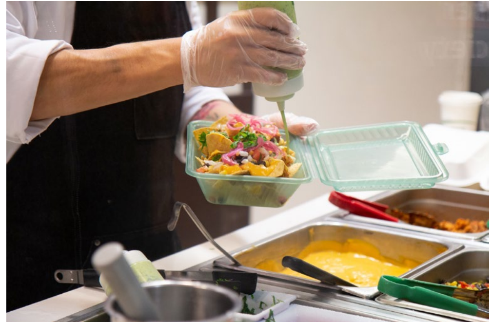
A Dining Services staff member completing a to-go order using a GoGreen container instead of a disposable single-use container.

The Energy Management Team organized two lunch and learn sessions on climate adaptation for the Facilities Services staff, to understand more about the terminology, impacts and relevance to the university's policy planning and services.