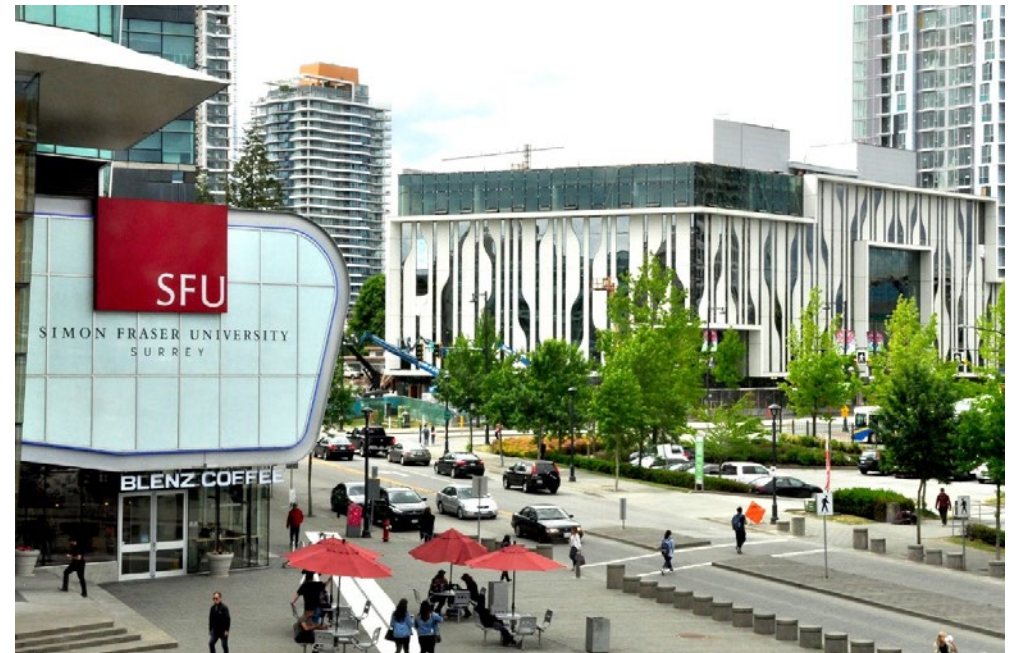
External view of the new Surrey Sustainable Energy and Engineering Building.

The new SEE building was completed in time for classes to commence in the Fall 2019. The SEE building houses Mechatronics labs and a new Sustainable Energy and Environmental Engineering program in Surrey, one of BC's fastest