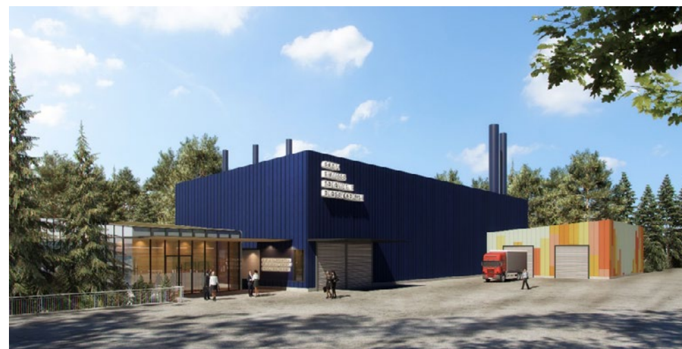
Digital rendering of the upcoming biomass heating plant.

The Burnaby Mountain District Energy Utility project will provide high efficiency, low carbon energy (using biomass, from waste wood chips) for the Burnaby campus and UniverCity residents. On completion the project will reduce up to 80% of the Burnaby GHG emissions, as biomass will replace the majority of natural gas consumption to heat the campus. The project is a collaboration between SFU, the SFU Community Trust and Corix Utilities.