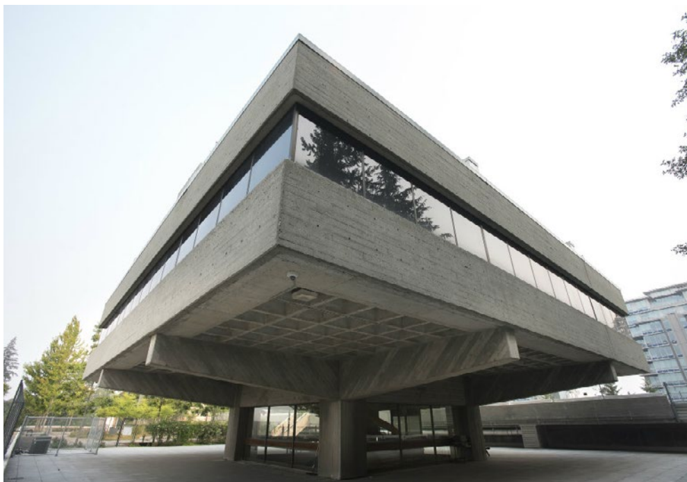
External view of SFU's Water Tower building on SFU's Burnaby Campus.

degrees Celsius, making the occupants uncomfortable. In addition, the boiler and chiller serving the 16,000 square foot office area were approaching end of life. This provided the opportunity to implement an innovative approach, to improve occupant comfort and system reliability, while reducing the energy consumption and GHG emissions. The single glazed system was upgraded to dynamic glazing (a glazing system that can adjust tint automatically, to optimize the inside temperature). This, coupled with thermally broken window frames, significantly reduced the cooling and heating demand of the building. A heat recovery chiller system was designed and tied to the data centre condenser system to recover heat for space heating, thus further reducing the GHG emissions.