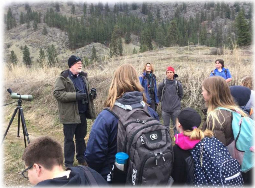
Grade 6/7 Students Birdwatching at Boothman's Oxbow

Collectively these changes will continue to support us as we strive to reduce our carbon footprint in 2018.