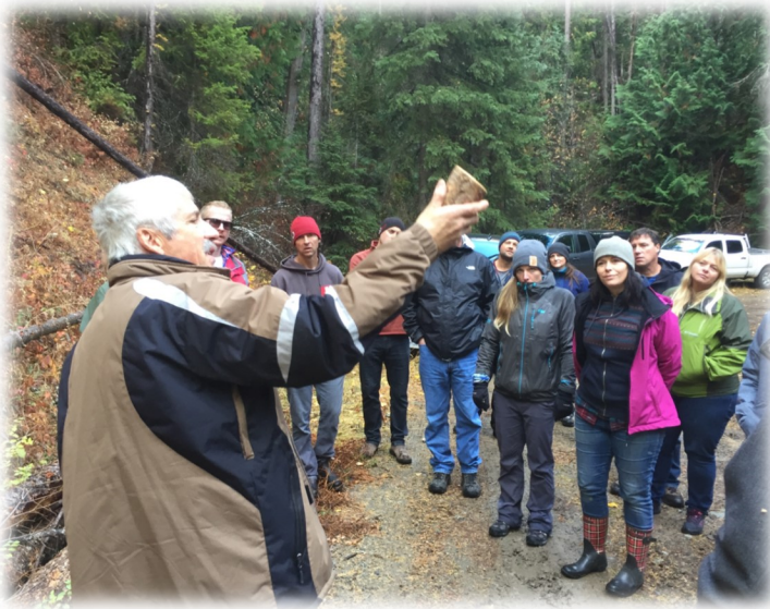
Teacher Woodlot Pro-D

SD51 also did an upgrade to the cooling system at Grand Forks Secondary School by installing a chiller system. This system removes heat from a liquid, which then can be circulated through a heat exchanger to cool equipment.