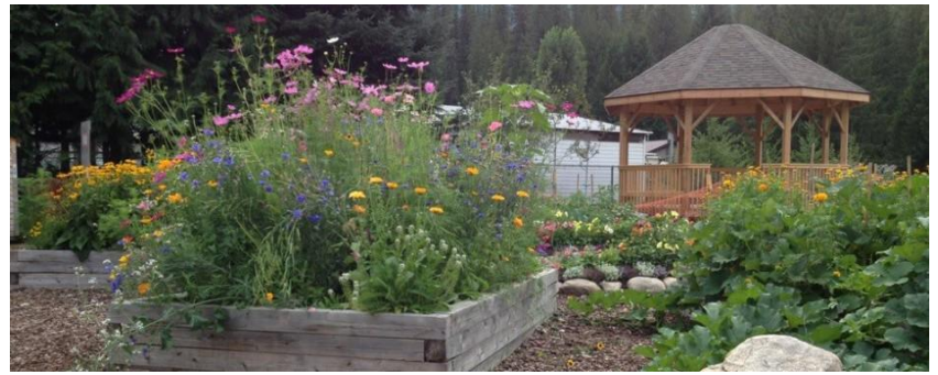
Salmo School Garden