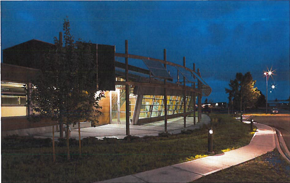
Centre for Clean Energy Technology (CECET)