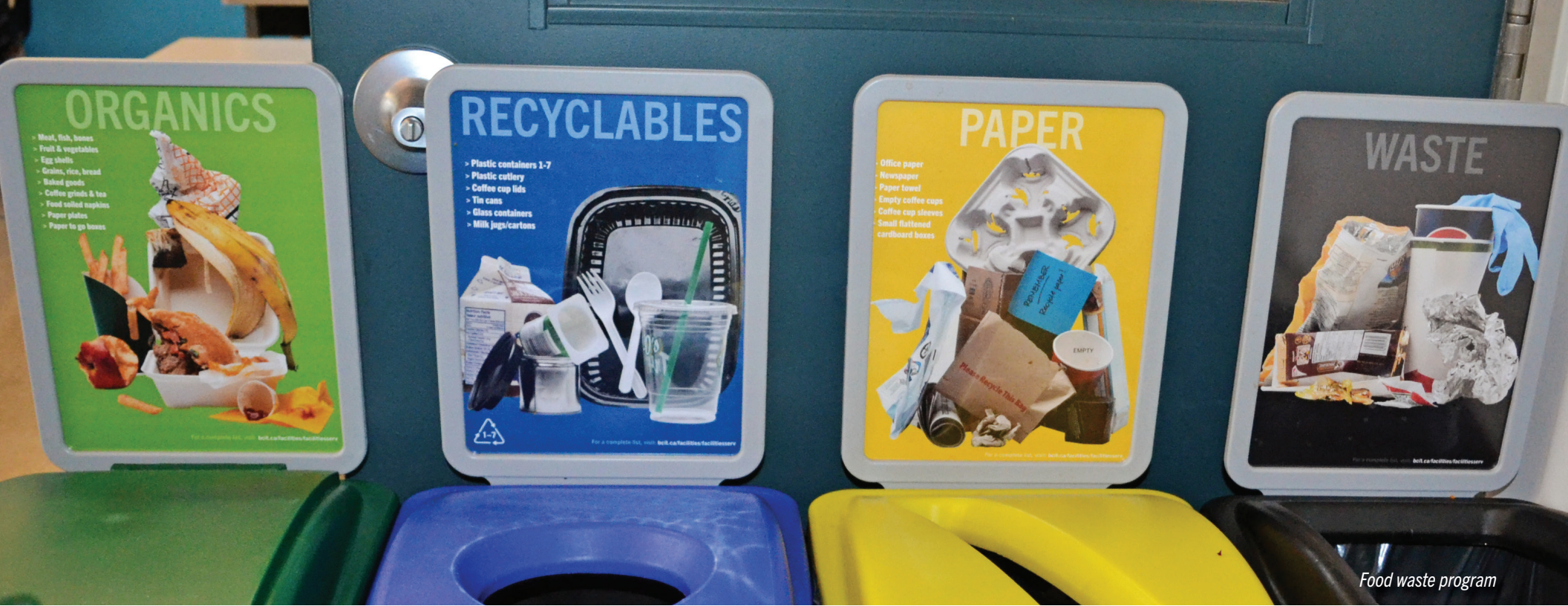
Food waste program