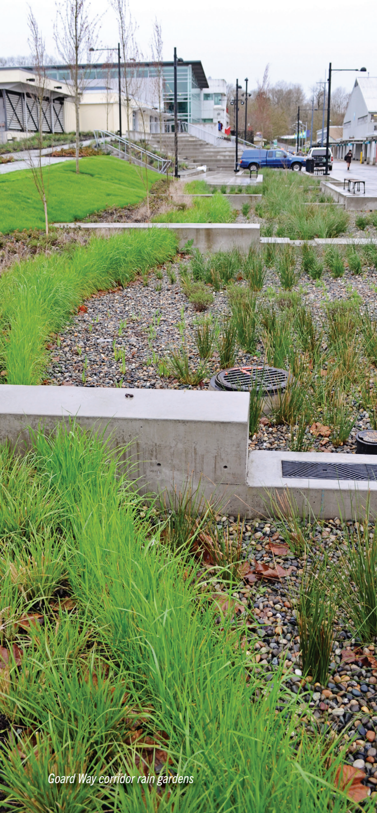
Goard Way corridor rain gardens