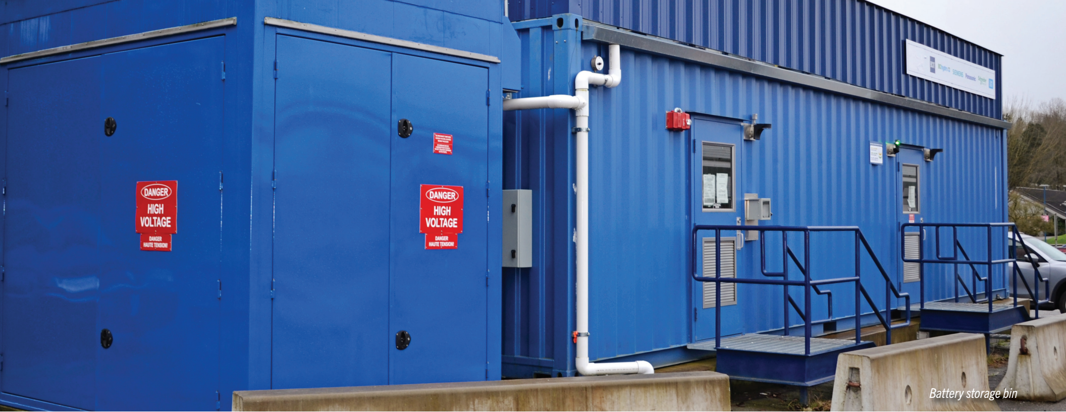
Battery storage bin