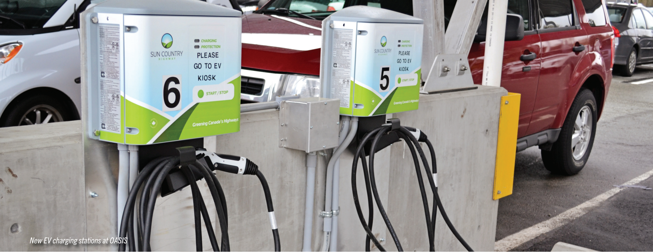
New EV charging stations at OASIS