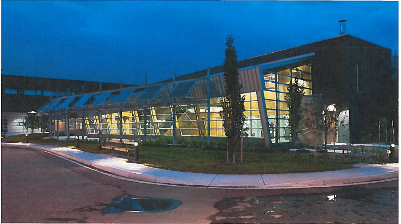
Centre for Clean Energy Technology (CECET)