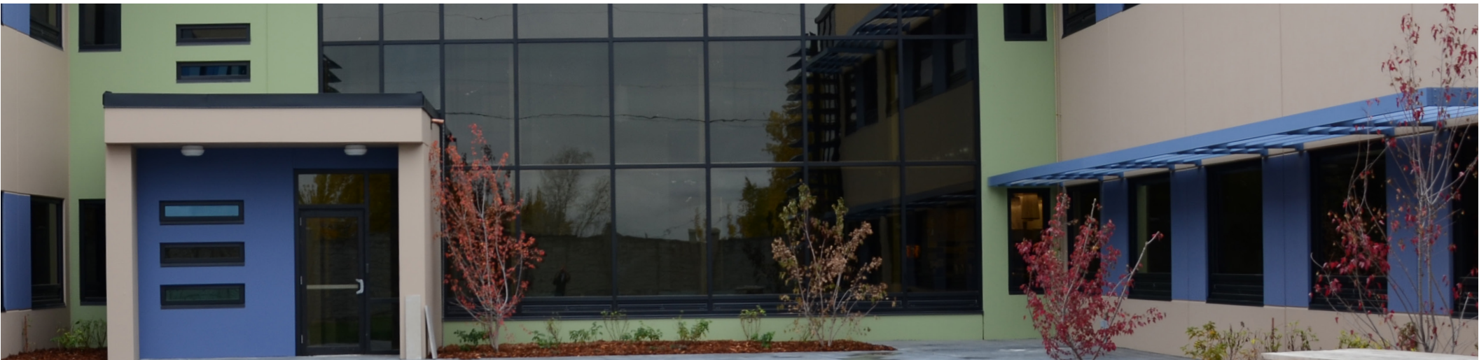
New Fort St. John Building

3. The third action taken is an effort to reduce paper consumption across the Commission. The Fort St. John office previously had 16 fax machines that printed upon receiving a fax. It now has four fax machines. These machines have now been streamlined and faxes go to an email inbox where they can then be forwarded to the recipient by email instead of printed. All promotional faxes can now be read and deleted instead of printed, therefore reducing paper consumption. This email fax system will also be put in place in Victoria this year.