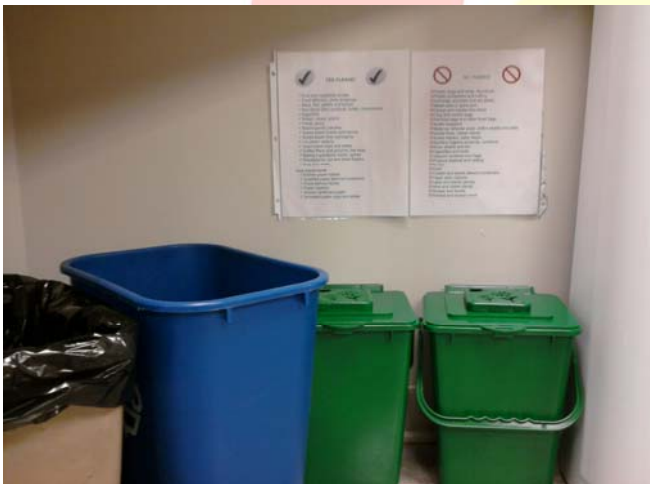
Figure 1: Recycling Area with Compost Bins

The BC Games office has been recycling for a number of years, but in 2011 we added soft plastic recycling and composting. Adding composting reduces our waste to almost zero. We are using a people-powered resource recovery company to remove our compost. The company is local and uses only bicycles to collect the compost bins (See Figure 1).