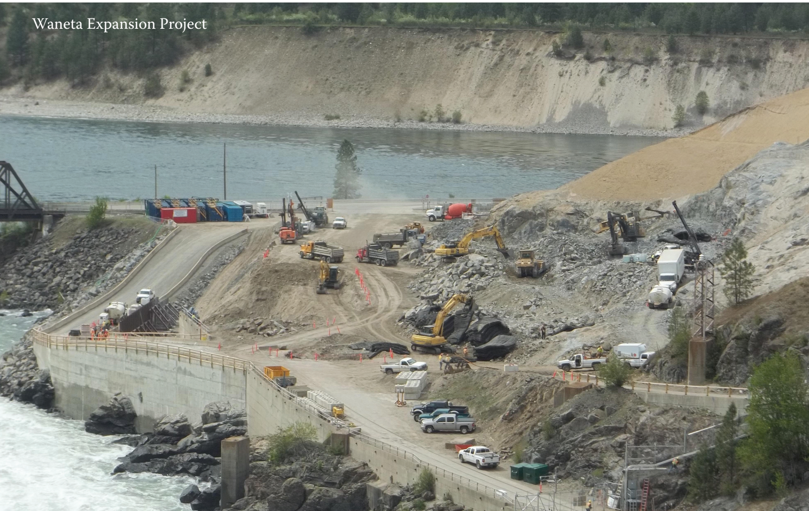
Waneta Expansion Project

“...the Waneta Expansion is expected to provide an average of 630 GWh per year of emission-free electricity.”