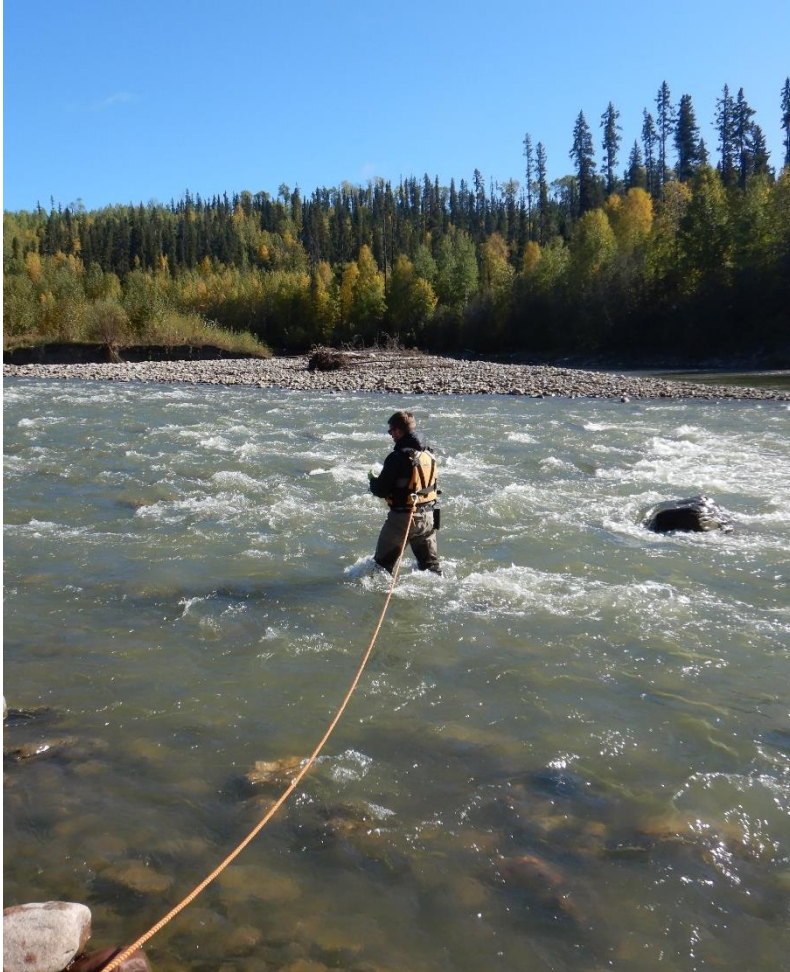
Figure 2: Monitoring in the Liard watershed

The BC - Yukon BWMA was signed in 2017. Within it, BC and Yukon agree to be proactive and to facilitate joint learning that will inform actions on transboundary waters. Technical details related to learning, transboundary objective setting, monitoring and management actions are set out in the Appendices to the Agreement. Transboundary waters for this Agreement refer to those within the Liard sub-basins, in which there are 19 transboundary rivers and streams.