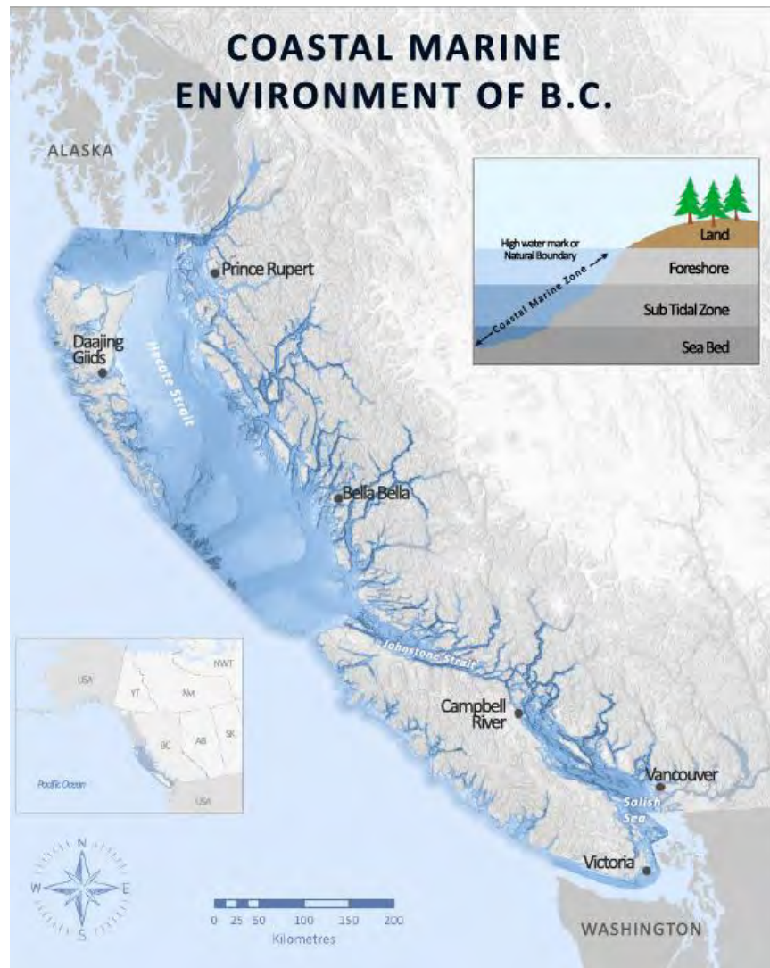
Figure 1. The strategy focuses on coastal marine waters between the borders of Alaska to the north and Washington to the south.

and interactive. We need to address the combined effects of a changing climate and our activities on the coastal values important to people living in British Columbia. And as the demand for natural resources continues to grow, we must find ways to reduce the pressures that threaten marine life, community well-being and economic stability, so that we can help restore resilience and return to a place of abundance.