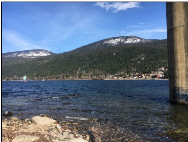
Photo 9. Site 9 - Orange bridge in City of Nelson - ~30 km downstream of Balfour Ferry terminal.

If you have any questions or comments please feel free to contact us.