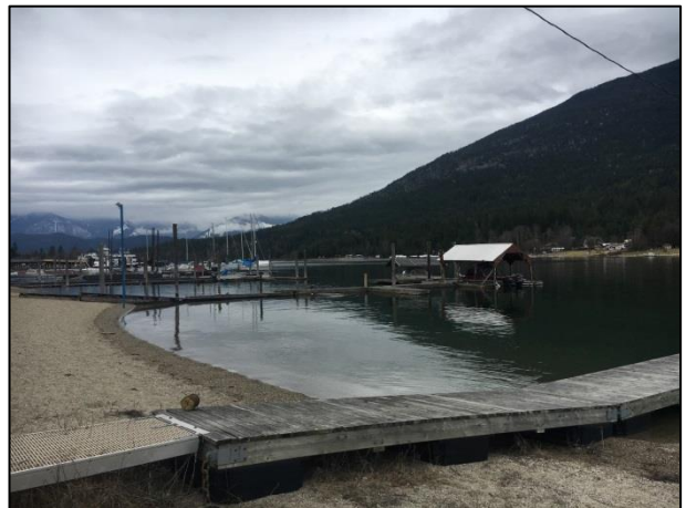
Photo 6. Site 6 - Balfour Wharf Government Beach