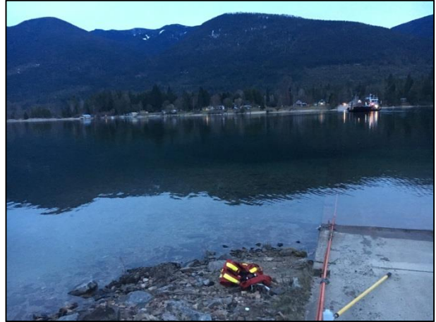
Photo 8. Site 8 - Harrop Ferry - ~7 km downstream of Balfour Ferry terminal.