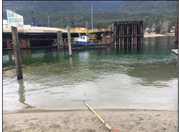
Photo 2. Site 2 - Dock 'n' Duck Dock.