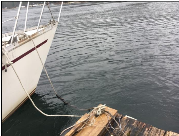
Photo 3. Site 3 - First Marina End.