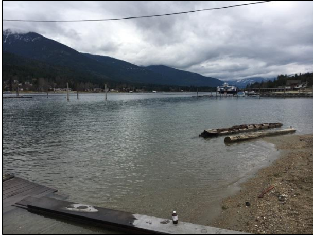
Photo 1. Site 1 - Balfour Beach Hotel Marina dock.