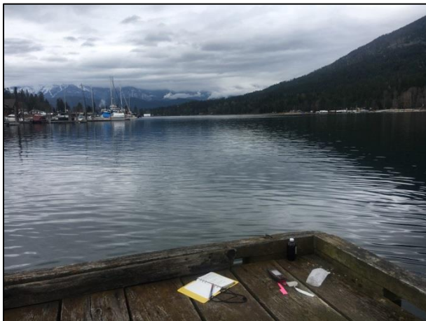
Photo 5. Site 5 - Balfour Wharf Government Dock End.