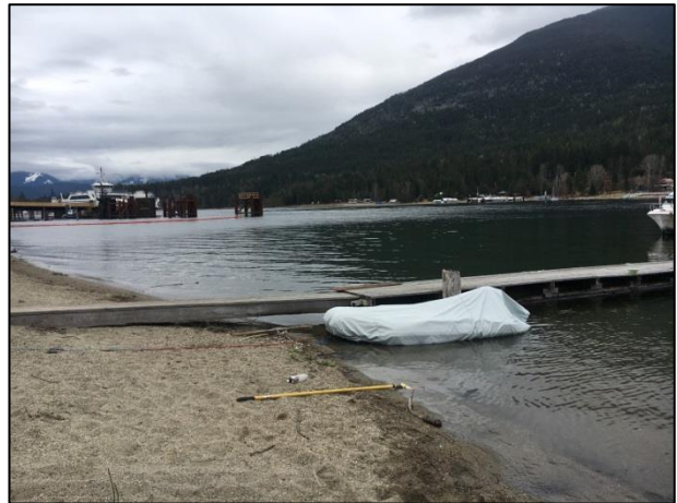
Photo 4. Site 4 - First Marina Beach