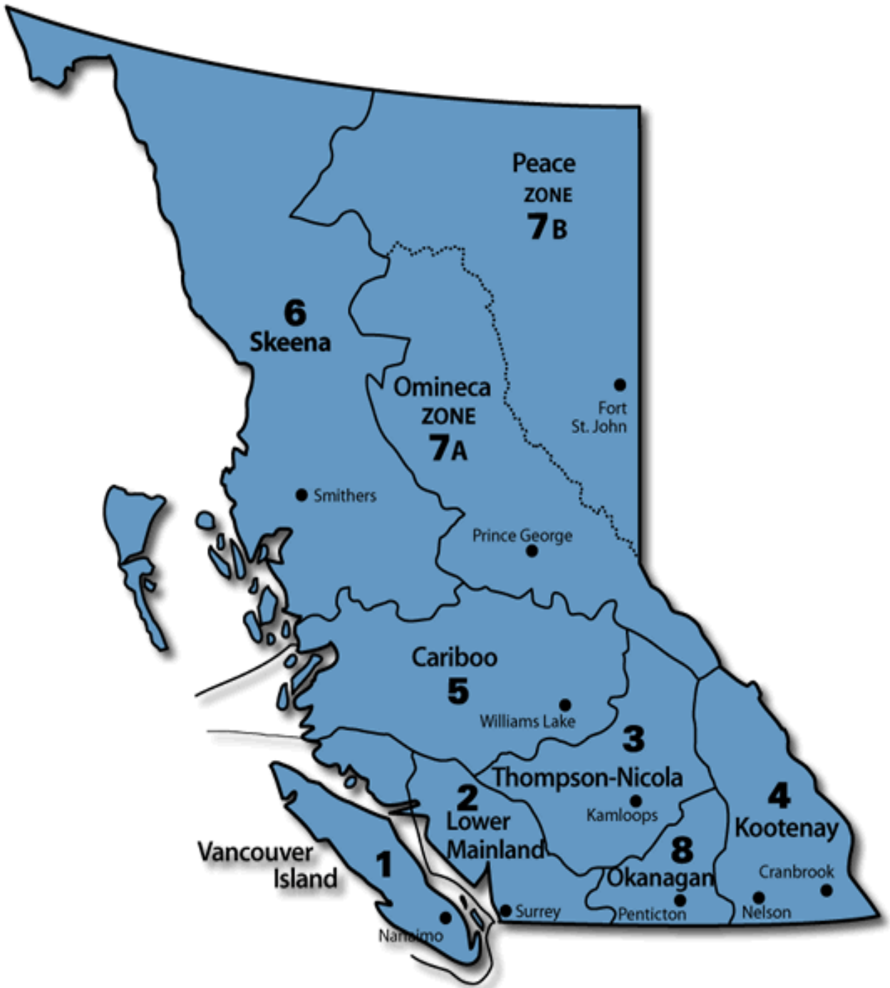
Figure 2. Regional boundaries for background soil determinations