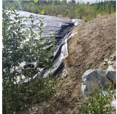
PEA– NW corner