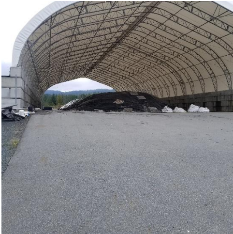
SMA - looking south