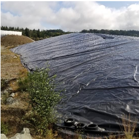
PEA north face