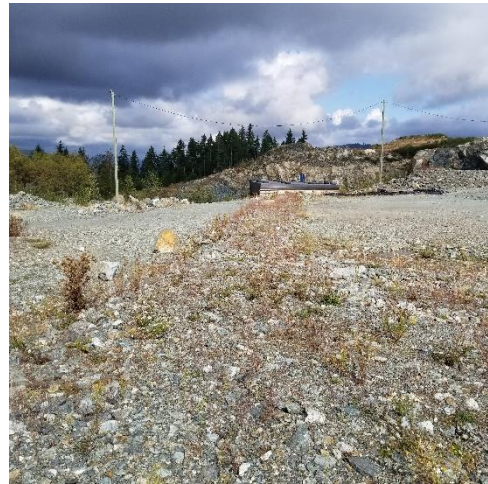
Leak and leachate detection works