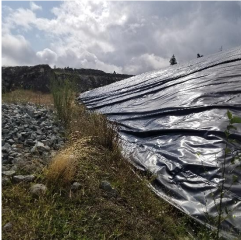
PEA – liner near NE corner