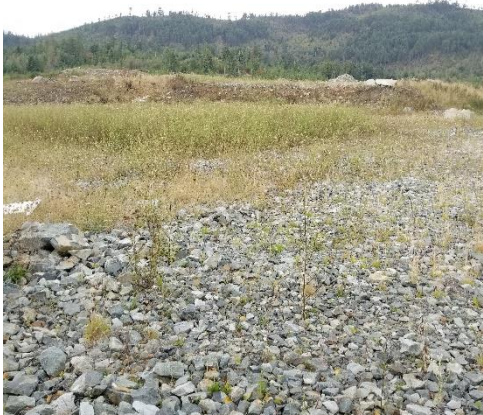
Contact water containment Pond