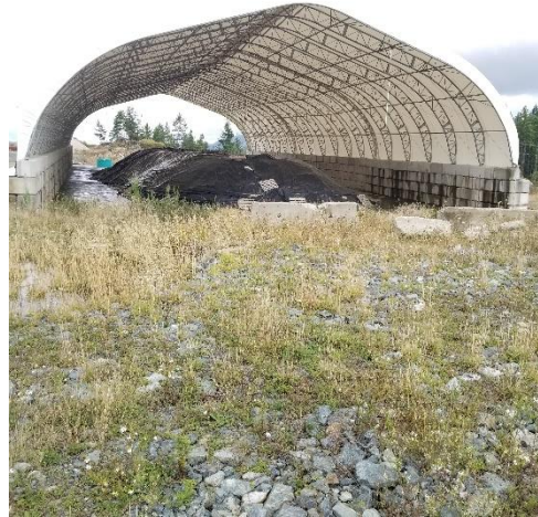
SMA - looking north