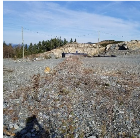
Leak and leachate detection works