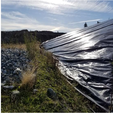
PEA – liner near NE corner