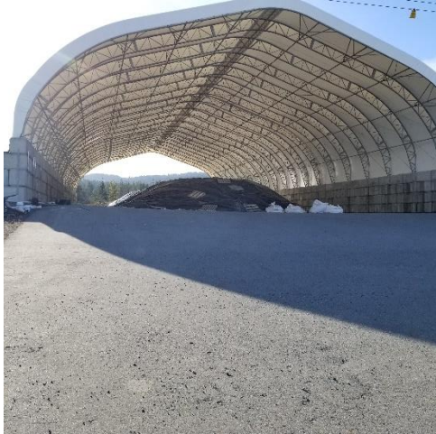
SMA - looking south