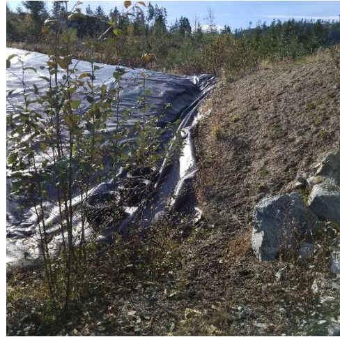
PEA– NW corner