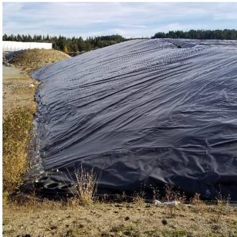
PEA north face