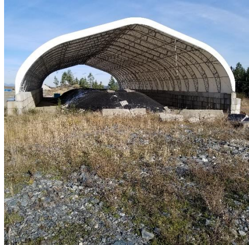
SMA – looking north