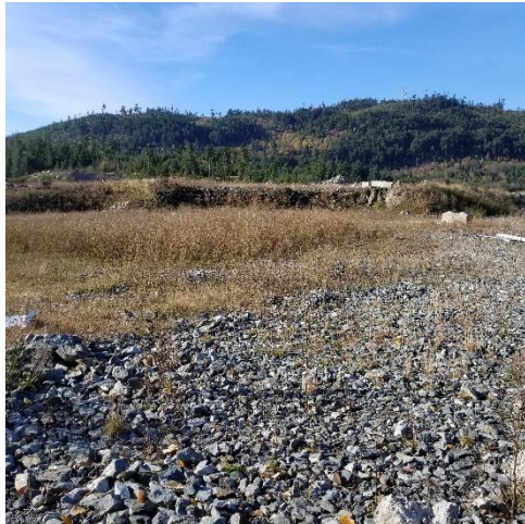
Contact water containment Pond