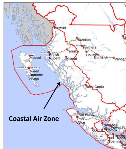
Figure 1. Coastal Air Zone.

The AQMS is the national approach to managing air quality in Canada. Under the AQMS, the CAAQS are developed to drive action to protect human health and the environment. Air zones are areas that exhibit similar air quality characteristics, issues and trends, and that form the basis for monitoring, reporting and taking action on air quality. The Coastal Air Zone (see Figure 1) is one of seven broad air zones across the province. Under the AQMS progressively more rigorous actions are expected as air quality approaches or exceeds the CAAQS. The level of action is guided by the Air Zone Management Framework outlined in Table 1.