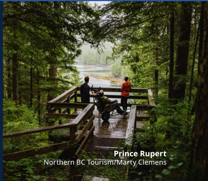
Prince Rupert Northern BC Tourism/Marty Clemens

B.C.'s tourism sector offers significant opportunities for private investment, driven by growing global demand for authentic, outdoor, and Indigenous experiences. A co-ordinated approach to investment attraction will help unlock new products, strengthen communities, and keep B.C. competitive in a rapidly evolving market. We will work with communities to connect private capital investment with tourism opportunities, supported by compelling investment pitches and a clear pipeline of ready-to-go projects that showcase tourism's position as a priority growth sector.