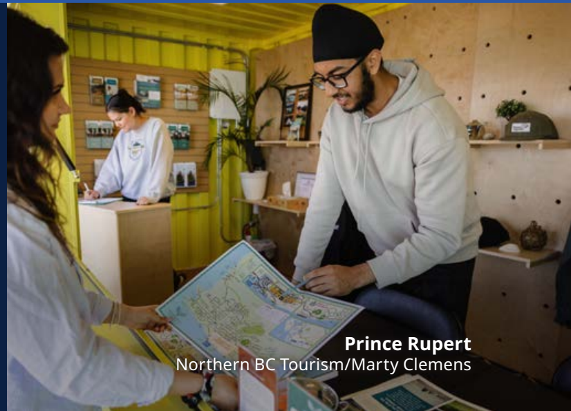
Prince Rupert Northern BC Tourism/Marty Clemens

Tourism and destination marketing create measurable economic impact by building awareness that inspires travel. Increased awareness leads to bookings and those bookings translate into visitor spending that supports local businesses, creates jobs, and strengthens communities.