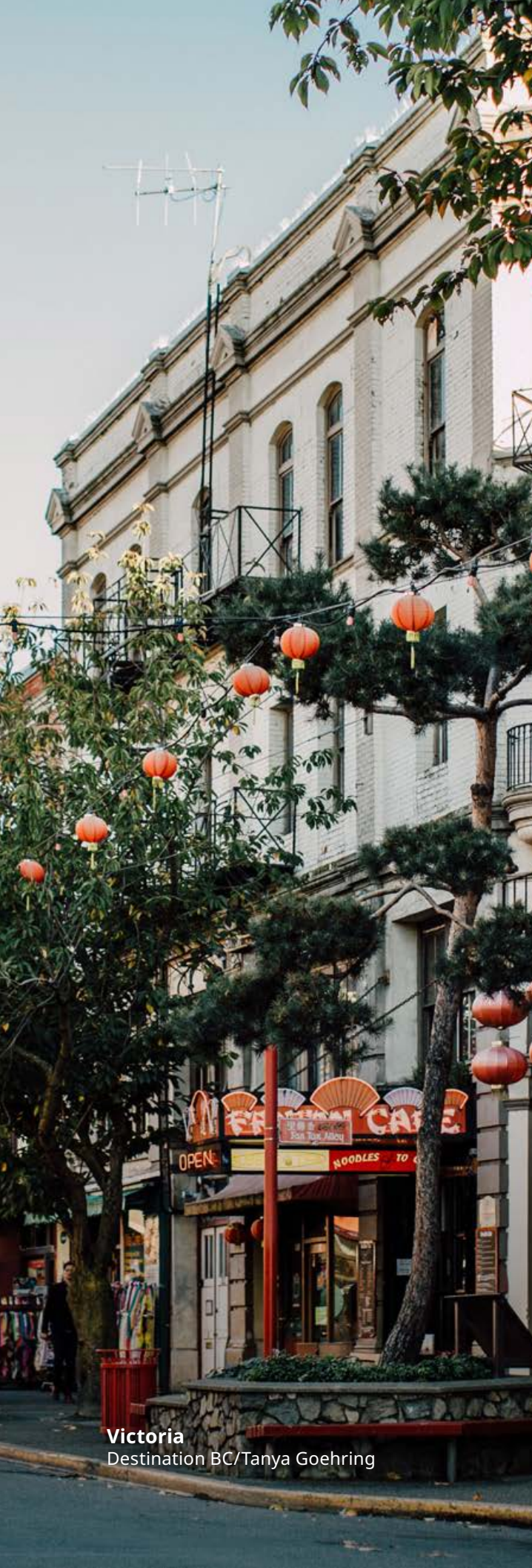
Victoria Destination BC/Tanya Goehring