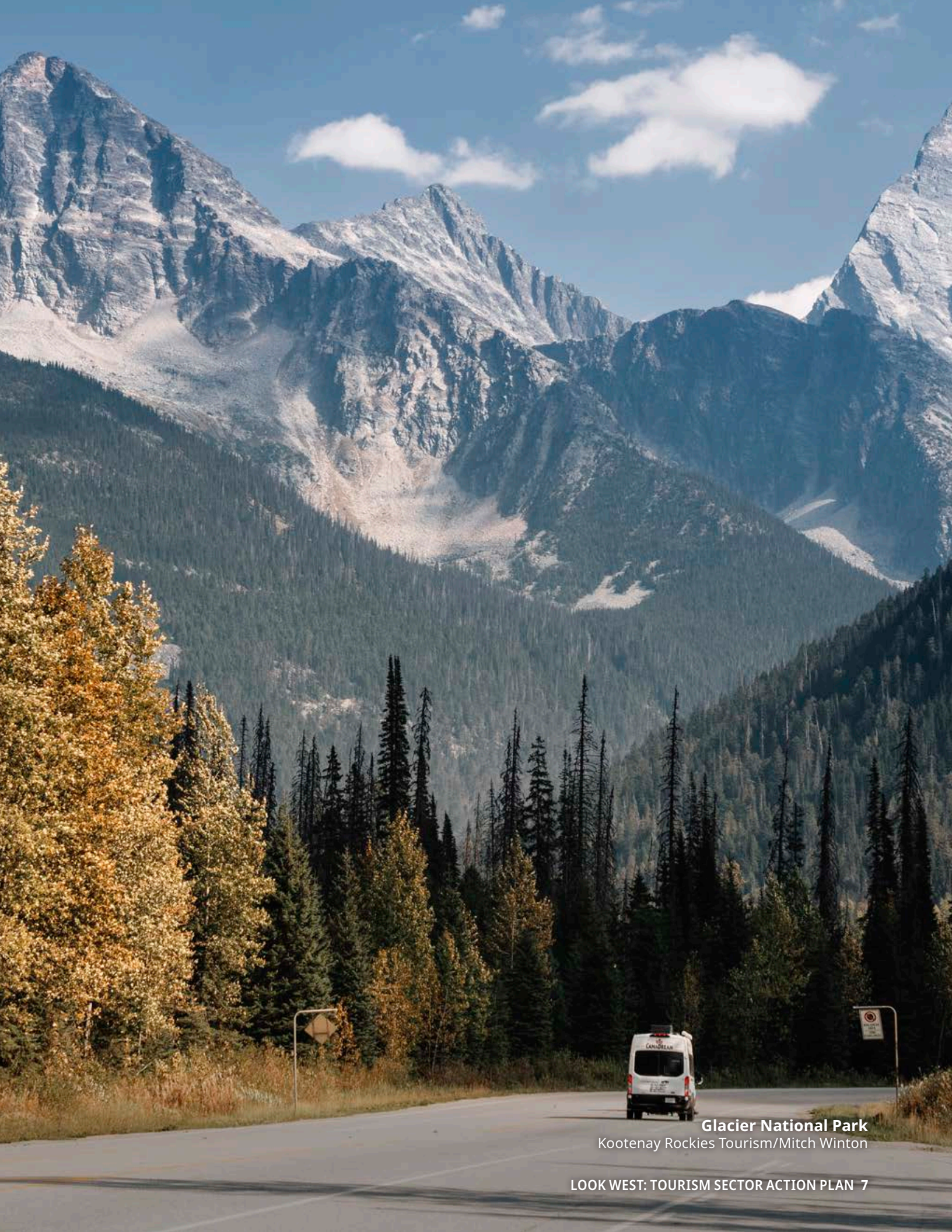
Glacier National Park