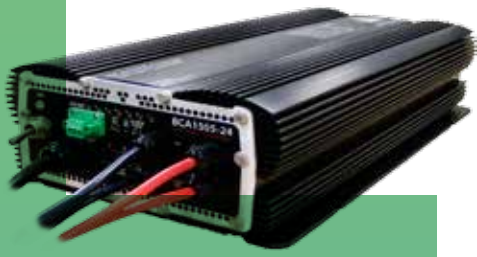
ANALYTIC SYSTEMS — AC BATTERY CHARGER — DELTA