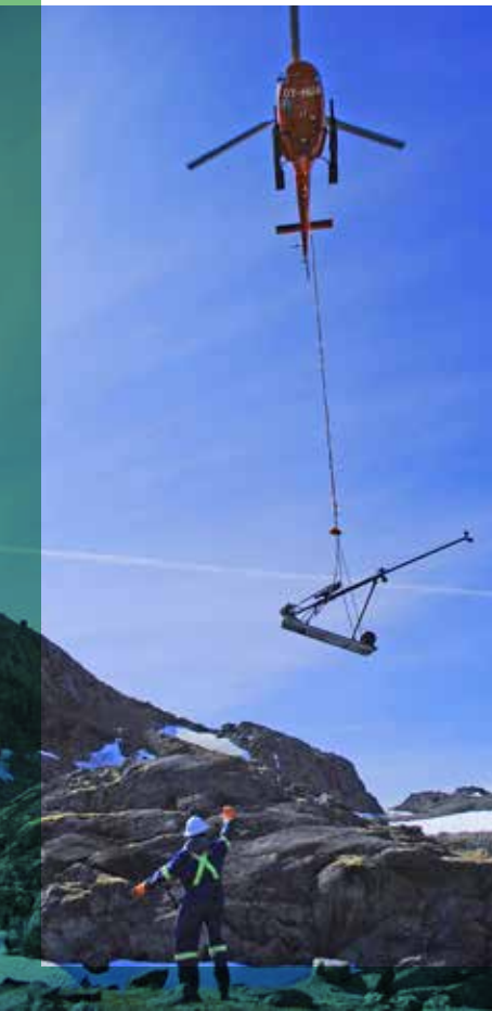
GEOTECH DRILLING — HELIPORTABLE, TRACK-MOUNTED AND TRUCK MOUNTED DRILLING RIGS — VERNON