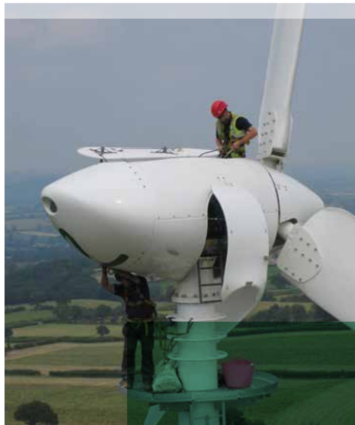
ENDURANCE WIND POWER – TURBINE ASSEMBLY – SURREY