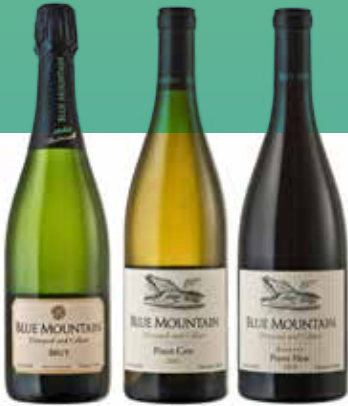
BLUE MOUNTAIN VINEYARD AND CELLARS — OKANAGAN FALLS