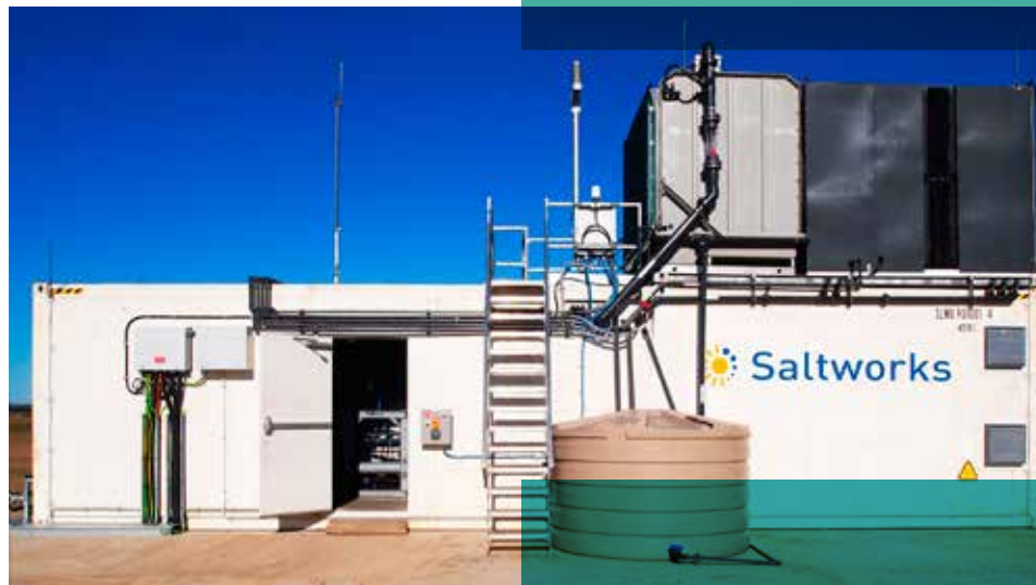
SALTWORKS – SALTMAKER – VANCOUVER

☑ B.C. is the only province that has less than 50% of all its exports going to the U.S.