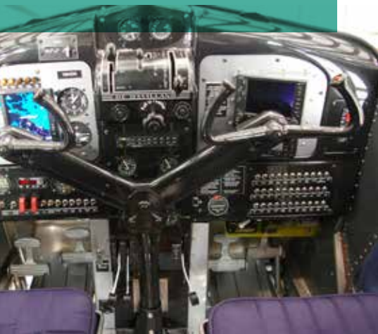
SEALAND AVIATION — TURBO BEAVER FLIGHT INSTRUMENT PANEL — CAMPBELL RIVER