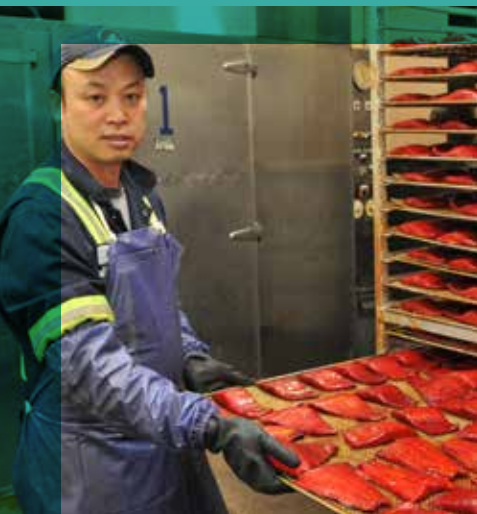
DELTA PACIFIC SEAFOODS — SMOKED SALMON — DELTA