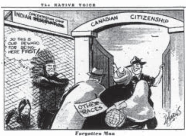
This editorial cartoon appeared in the Native Voice in 1947.