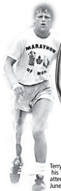
Terry Fox during his 1980 cross-country attempt. He died in June 1981 aged 21.

Fox commemorative coin is a first for Canada—it shows the likeness of a person other than a monarch