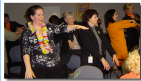
Ministry of Education staff playing freeze dance!

Promotes: gross motor development, musicality, self-expression, enjoyment of physical activity, vocabulary development, social skills