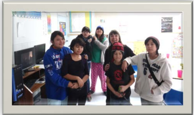
Yaqa Nukiy Afterschool Program