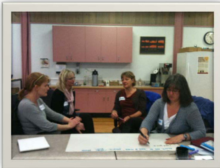
Nelson planning session April 2013

In April 2013, the communities of Creston, Kaslo, Nelson, Slocan Valley and Salmo hosted planning sessions to create community plans for 2013-2014. Each community is unique and each has its own goals and actions for the ensuing year. Planning sessions included representatives from the school district, post-secondary institutions, Interior Health, Aboriginal representatives, community service providers, libraries, municipalities, employment services and interested community members. The input and support from these participants is crucial in the development of the plans. The following five community plans are a direct result of the ideas, thoughts and innovative strategies shared at the sessions.