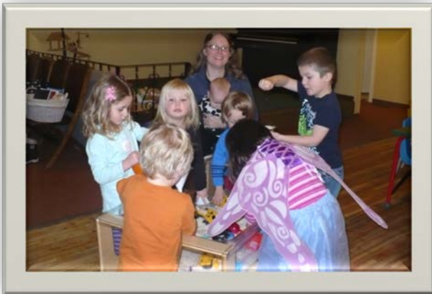
Parent and Child Time program- Balfour