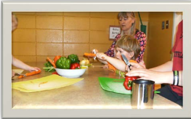
Little Chefs Program- Creston