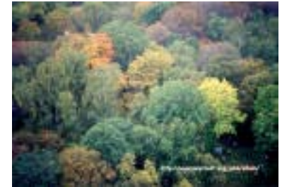
This is what people call the "Golden Forest"