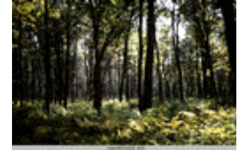
This is the boreal tree