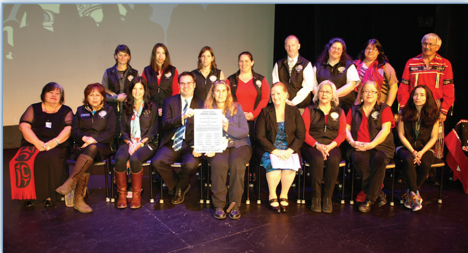
Photo of 2014 Agreement Signees