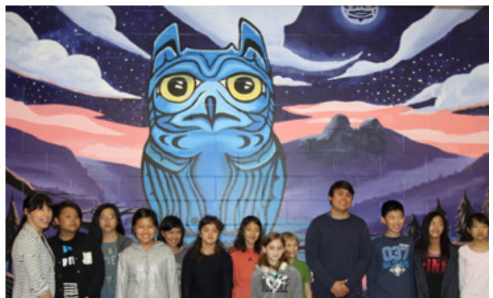
Students and staff at Sir William Osler Elementary School, along with a special guest artist, are all involved in the creation of an expansive piece of First Nations artwork