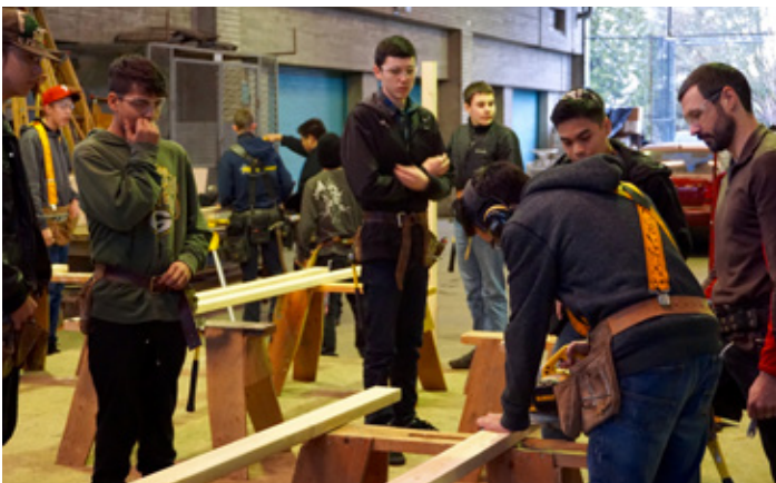
First Nations Trades Sampler - Over 40 youth of Aboriginal heritage from Vancouver and across the Lower Mainland spend the day at John Oliver Secondary working with industry professionals.