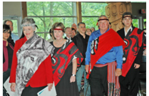
Photos above: signing of the Vancouver School District's first AEEA (June 25, 2009)