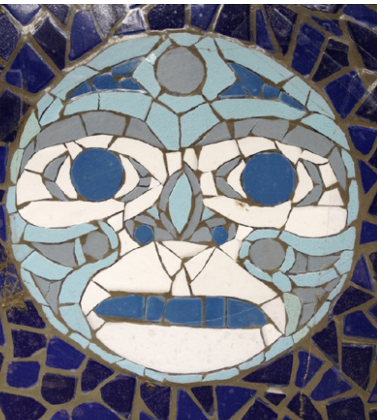
Grandview/uuqinak'uuh Elementary School tile mural.

issue at all levels of the K-12 system. The District is implementing an attendance strategy to track and improve attendance for all students. Recognizing that there may be different reasons for attendance issues amongst our Aboriginal students, our Aboriginal staff will be working with school support staff to ensure that these issues are recognized and supported in a sensitive and appropriate manner.