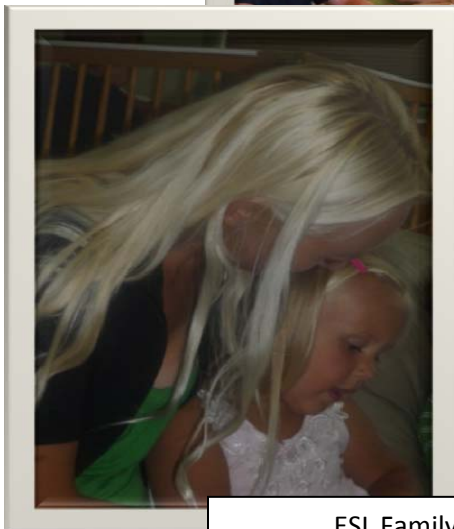
ESL Family Time Kootenay Family Place