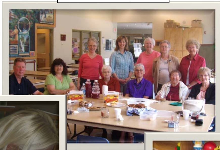
Seniors’ Computer Class Windup Robson Community School

The right hand column, “Progress”, of Evaluation of the 2009-2010 Plan in Section C contains our evaluation comments.