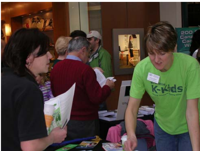
Family Literacy Day at Cherry Lane, Penticton