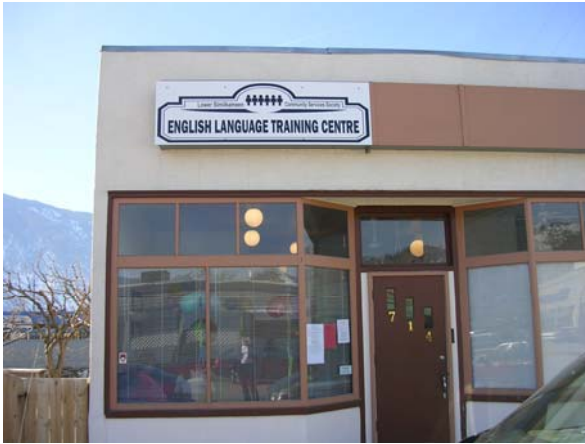
Keremeos ESLSAP program celebrates the opening of its Language Training Centre