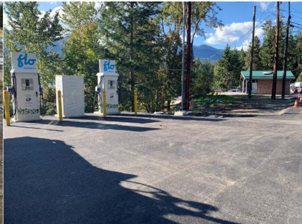
New electric vehicle charging stations were installed at Kootenay Bay.