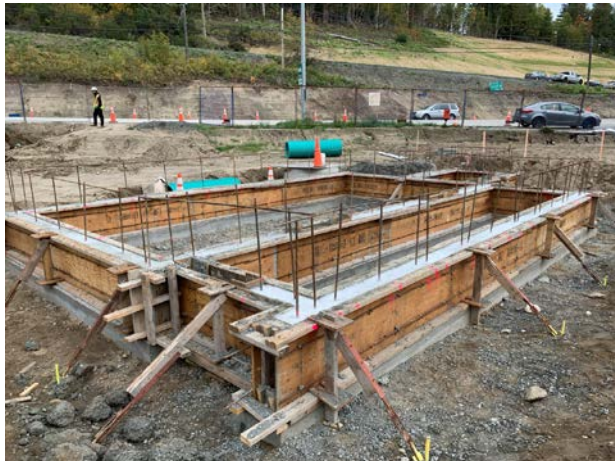
The foundation of the Balfour terminal's new washroom.