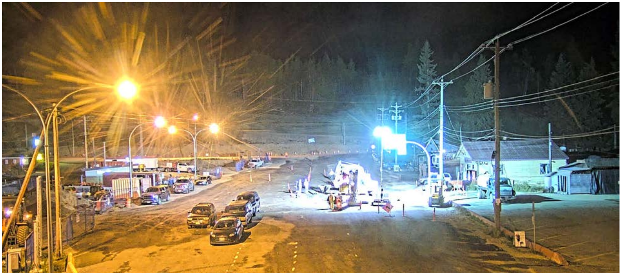
The majority of night work activities at the Balfour terminal are now complete.

Other terminal progress updates include the installation of new signage and lighting, and completion of the new washroom's foundation at the Balfour Terminal. At Kootenay Bay, crews recently completed asphalt paving and the installation of new safety signage as well as electric vehicle charging stations.