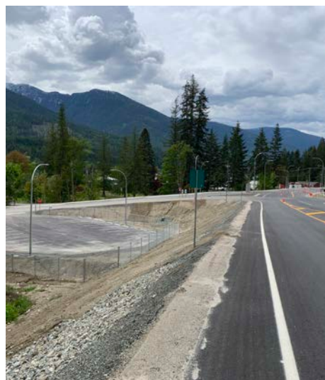
Highway 3A looking down to the new crew parking lot.