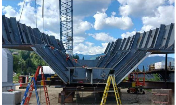
The two side hull pieces attached to the void keel.

Once the ship's hull has been assembled and the ship's engines, thrusters, and batteries been installed, the ship will be floated and remain moored near the shore. At this point, the vessel will be outfitted with mechanical systems, electrical systems, control systems, interior components and finishes.