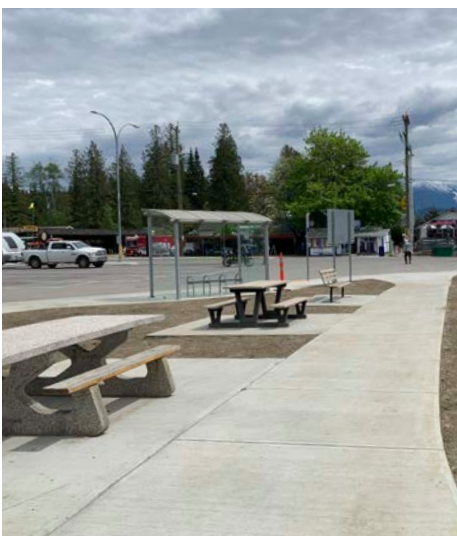
The new picnic tables and bus stop.