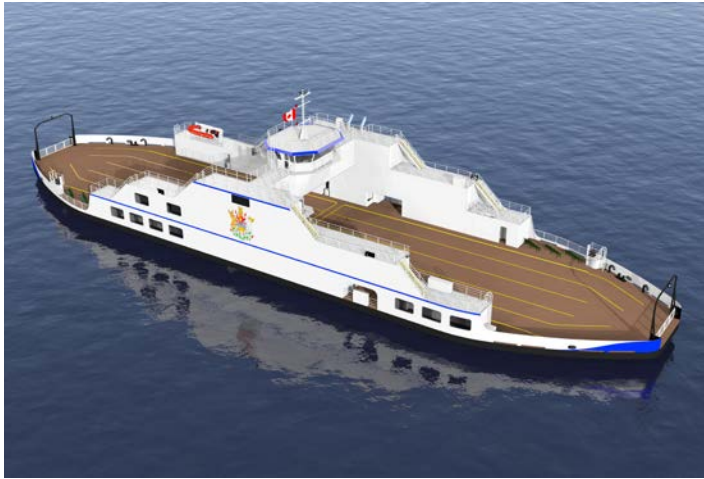
Artists rendering of the new electric-ready vessel.