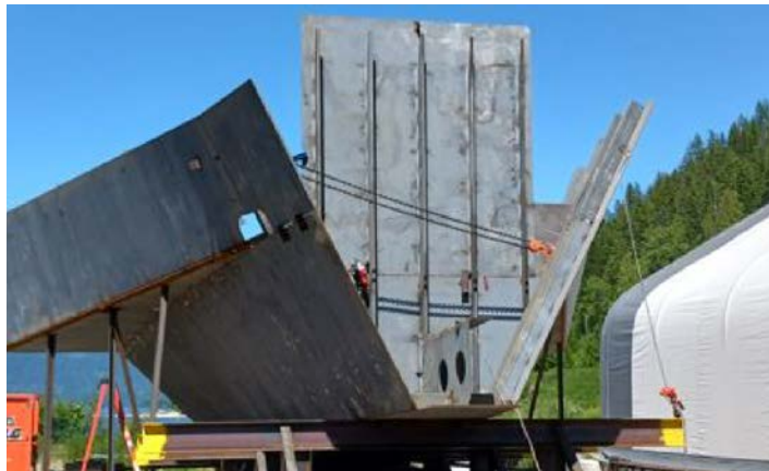
The first bulkhead installed into the void of the hull.