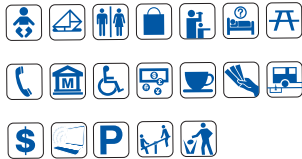
T-001-Td Overlays Page 2