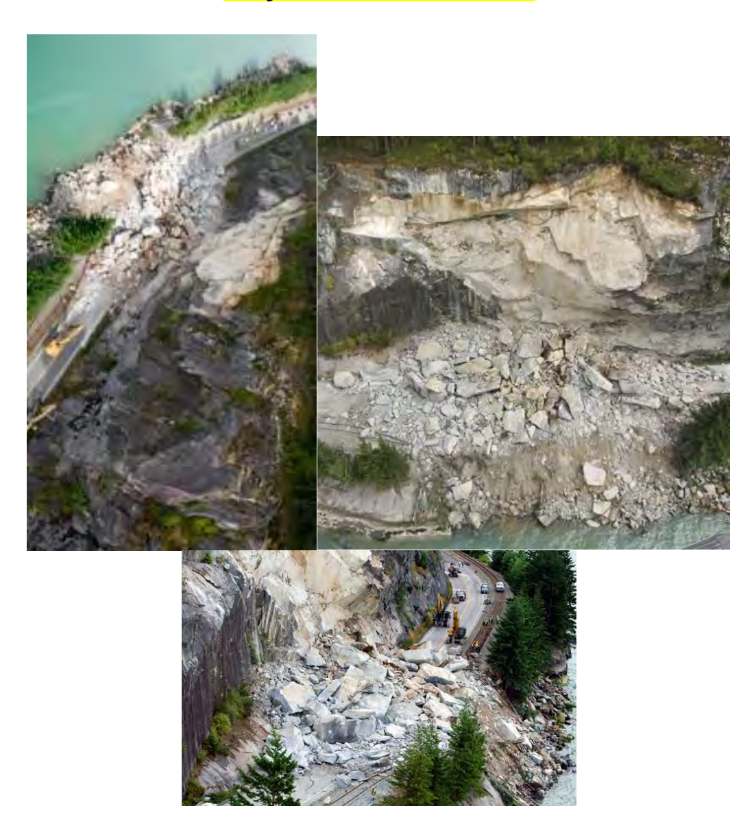
Rock Slide - Highway #99 Porteau Cove

Edited and Maintained by: New Products Evaluation Standing Committee