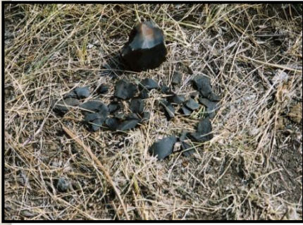
Chipped stone flakes and core artifacts

Step 1: If suspected archaeological materials or features are encountered, immediately stop work, create a 30m buffer around the discovery site, and secure the area. Do not undertake further work within the buffer zone that could disturb the find, including moving any soil from the vicinity of the site or adjacent spoil material. Contractors may be required to undertake a variety of mitigative measures, such as drainage or erosion control, slope stabilization measures, or erecting fences etc. to protect the site. Please see the Standard Specifications for Highway Construction Section 165.20 for more information. Step 2: Contact the Archaeology Branch for advice on further action. Step 3: Inform the Ministry Representative for your project or District Office Area Manager for your service area.