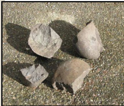
Fire altered rock