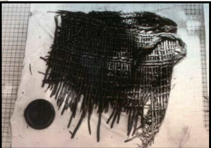
Waterlogged basket (cleaned)