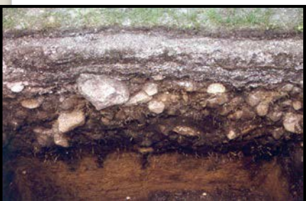
Shell midden deposits