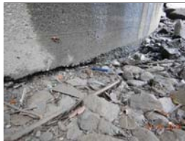
North abutment footing