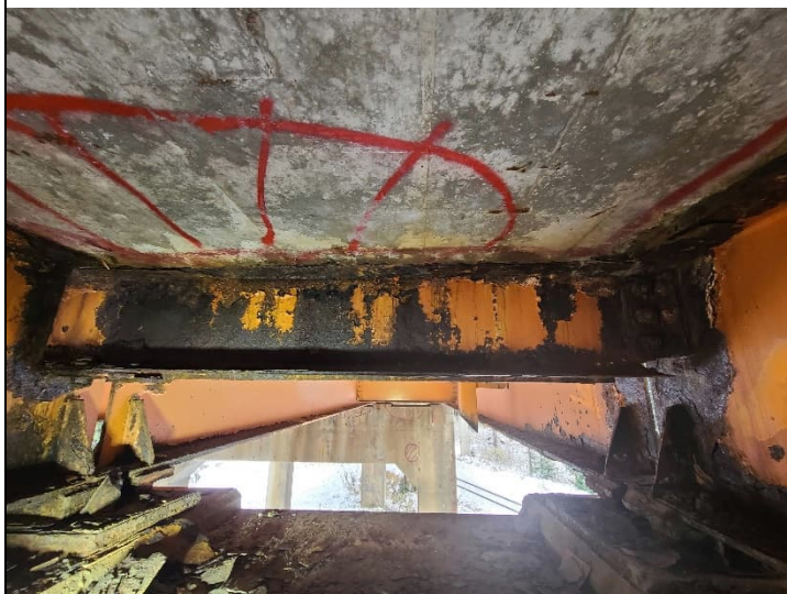
End Diaphragm Repair

Reference to Contract Drawing: 1522 - 106