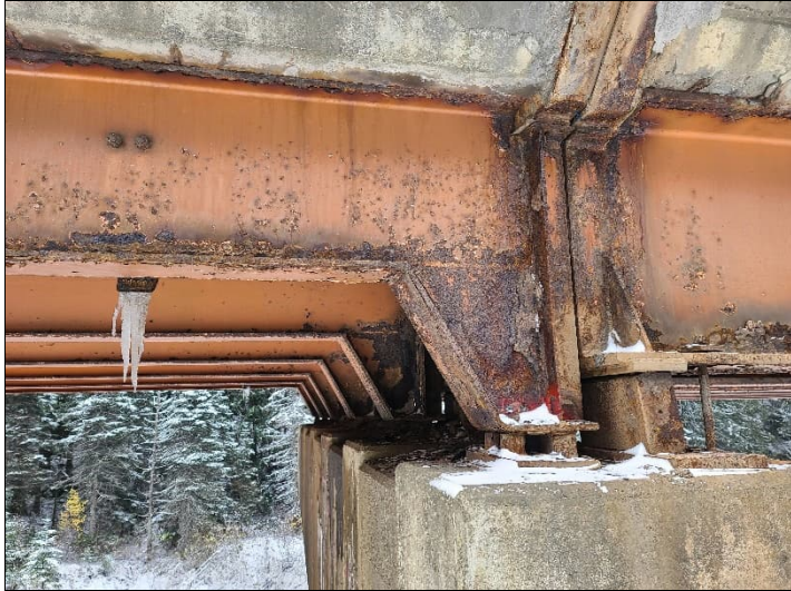
Stringer End Repair