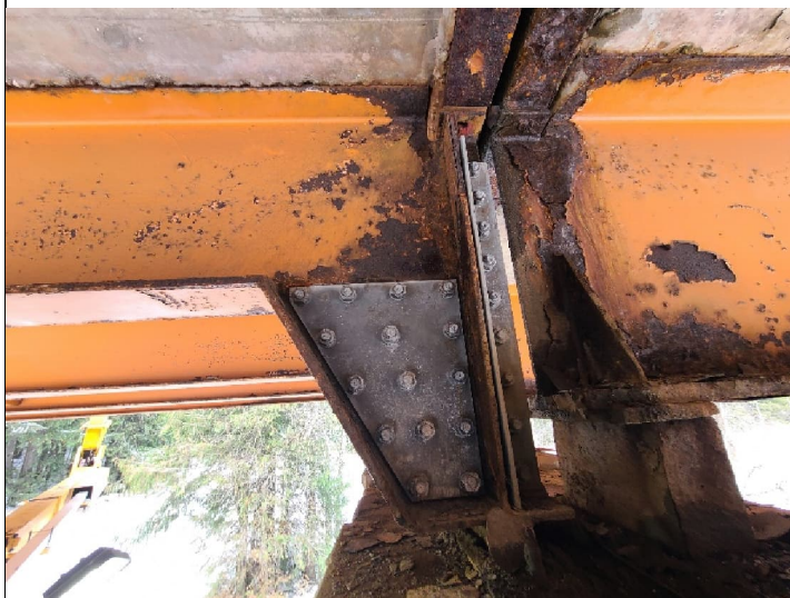
Stringer End Repair