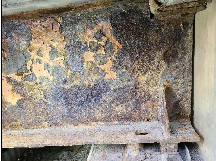
Stringer End Repair

Reference to Contract Drawing: 1522 - 106