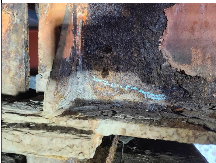
Stringer End Repair

Reference to Contract Drawing: 1522 - 106