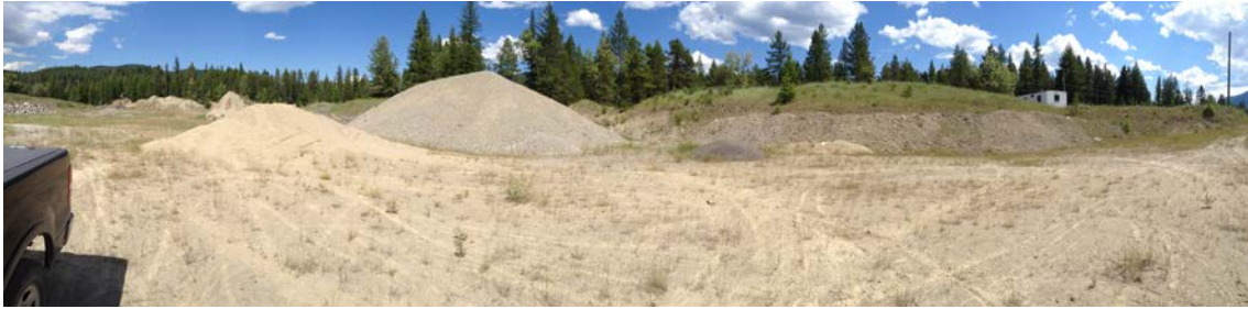
June 2016, pit stockpiles.