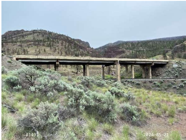
01491 2024-05-21 North Looking South