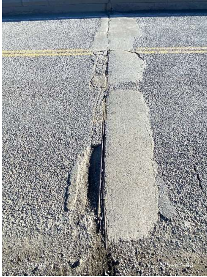
Figure 3: Pier 1 joint