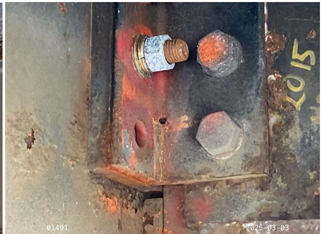
Figure 16: Pier 3 span 3 stringer F south face