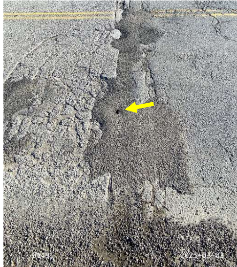
Figure 6: West abutment joint