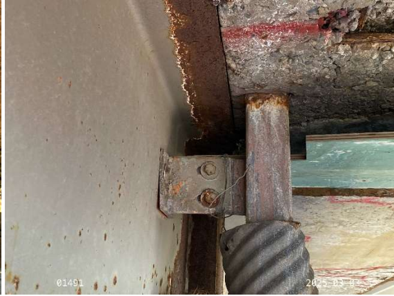
Figure 14: Pier 1 span 2 bay 5 drain anchor