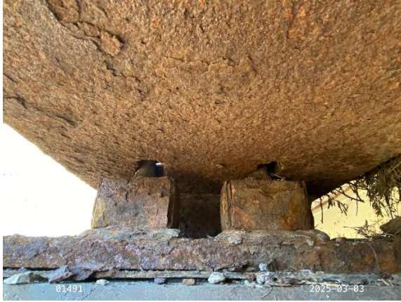
Figure 13: Pier 1 span 2 bearing F