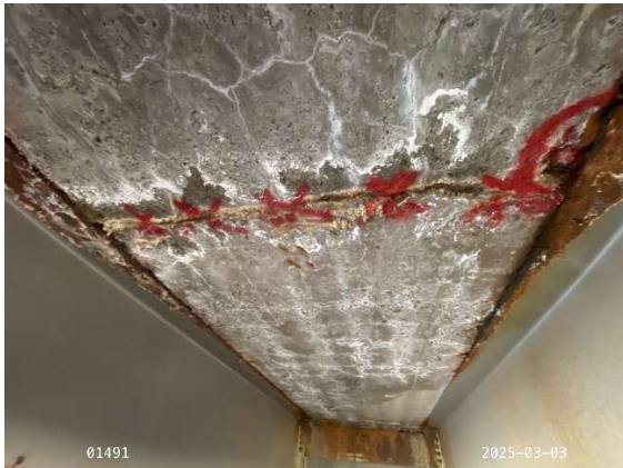
Figure 7: Span 1 bay 4 east of diaphragm 1