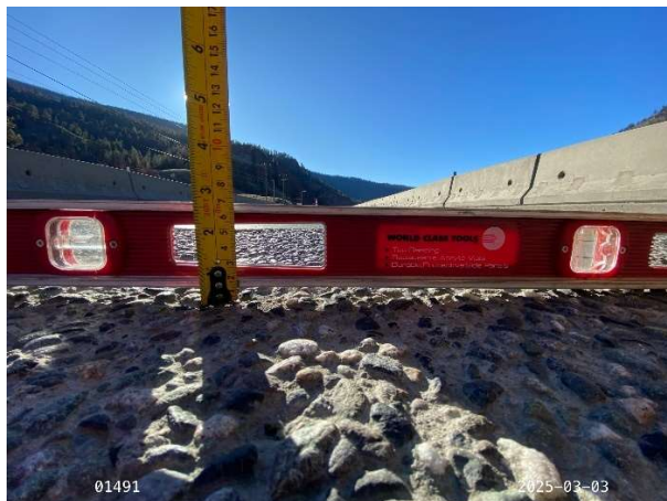
Figure 1: Span 1 north lane south wheel path rutting