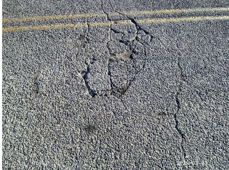
Figure 4: Span 3 north lane 3m east of pier 3