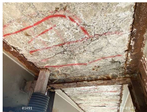
Figure 10: Pier 5 span 6 bay 5