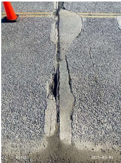
Figure 5: Pier 5 joint north lane