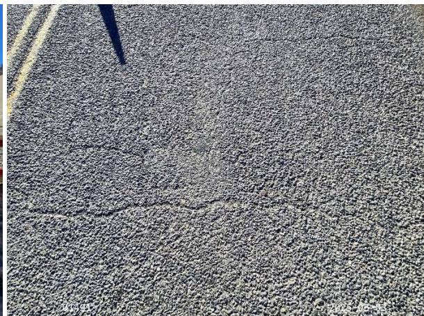
Figure 2: Typical deck crack