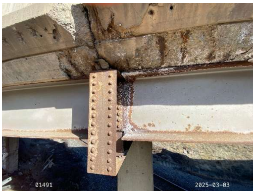
Figure 9: Pier 2 north end