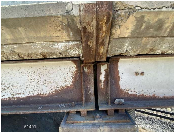
Figure 11: Pier 1 north end