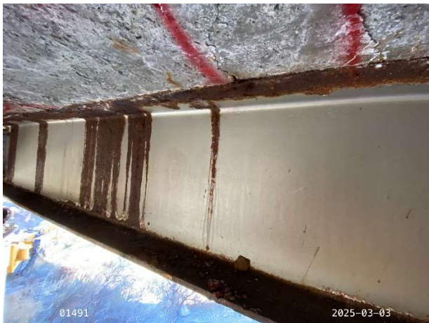
Figure 15: Span 1 stringer F south face