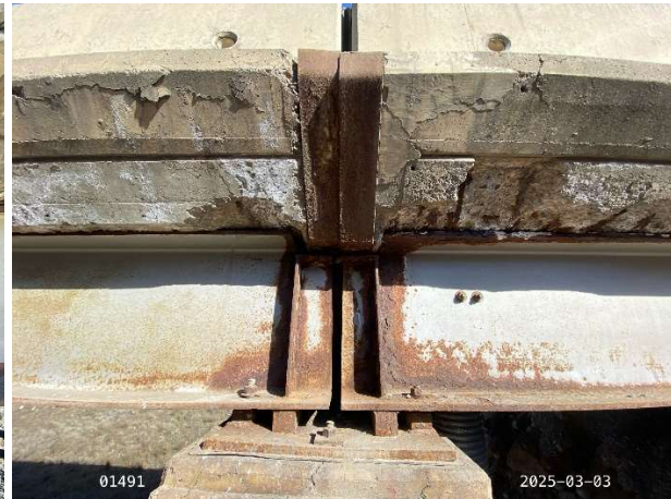
Figure 12: Pier 5 north end