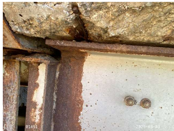
Figure 8: Pier 1 span 2 stringer F