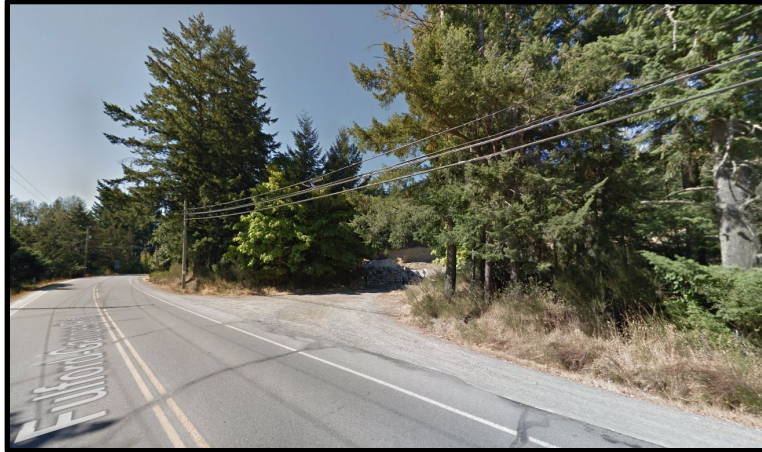
Figure 1: VIEW OF HOREL PIT ACCESS AREA LOOKING SOUTH AT ACCESS POINT

HOREL PIT LAYDOWN AREA T-3 – HOREL PIT LAYDOWN AREA PROJECT NO. 18090 PROJECT NAME: CUSHEON CREEK BRIDGE March 01, 2025