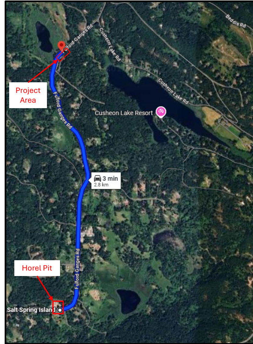
Figure 3: DISTANCE FROM PROJECT AREA TO HOREL PIT LAYDOWN AREA