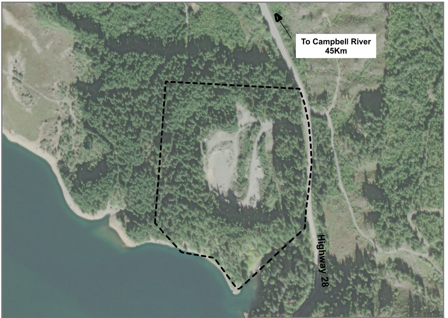
SITE MAP (Scale: 1:5000)