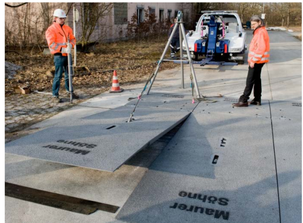
Fig. 2 - Opening with wrench and tripod