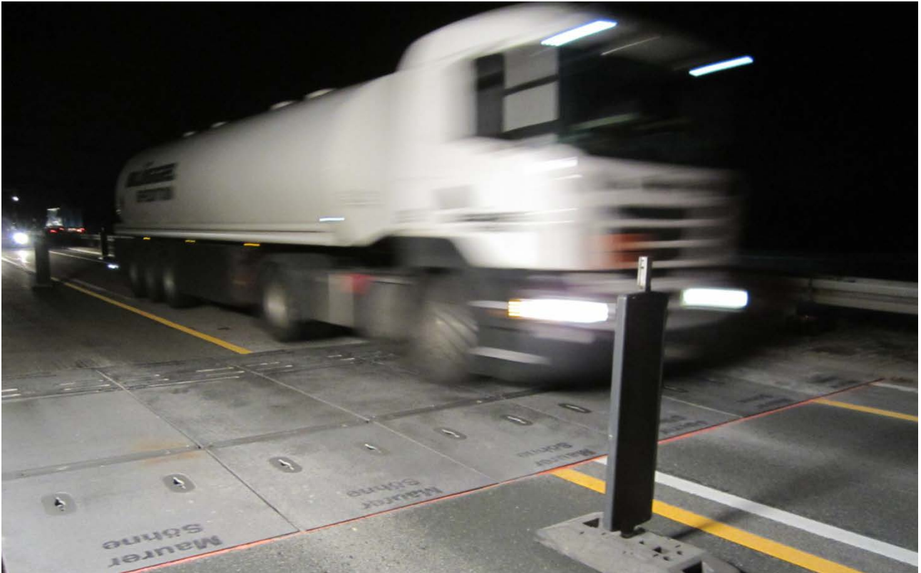
MAURER MMBS® - Modular bridging system in service

In the former West Germany, the majority of bridges were constructed between 1960 and 1980. In former East Germany it commenced in 1990. Depending on the time of construction, a big increase in terms of strain for these bridges can be noticed. Be the cause in an increase of load cycles or in terms of wheel loads, the existing bridges require manifold actions for their strengthening. The budget for the maintenance of federal roads and bridges is estimated to be annually 3 billion Euro, and this for the next decade. The share of this budget for engineering structures like tunnels and bridges is in the range of up to 45%.