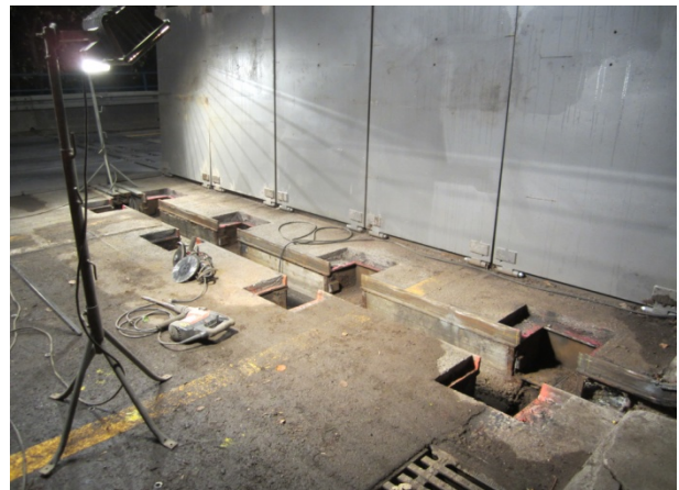
Fig. 4 - Job site