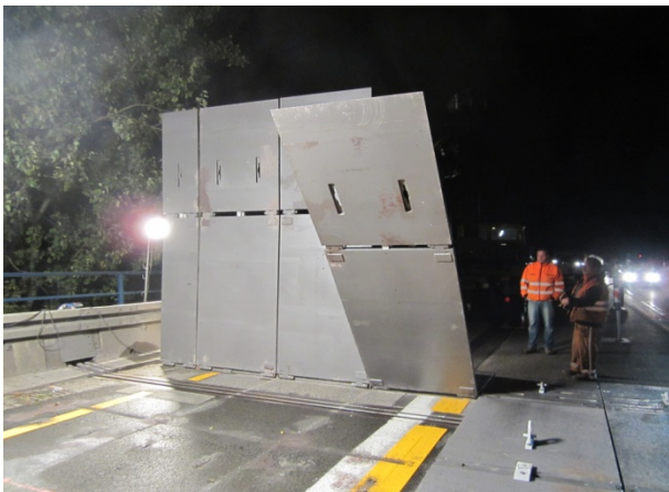
Fig. 3 - Preparation for night shift works