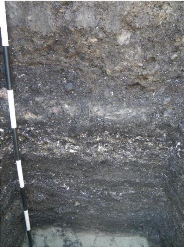
Photograph 1: Shell and ash layers in a midden site, Vancouver Island.