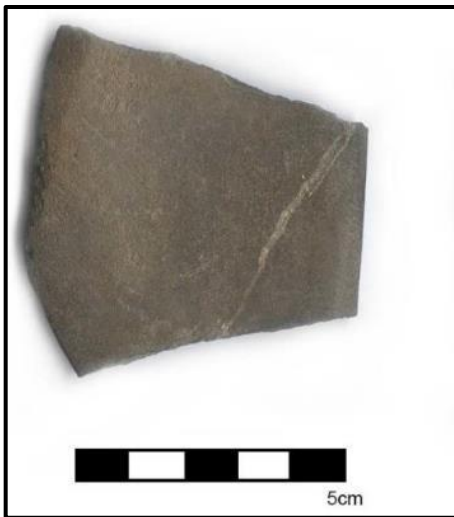
Photograph 17 - Sandstone abrader fragment (i.e., whetstone).