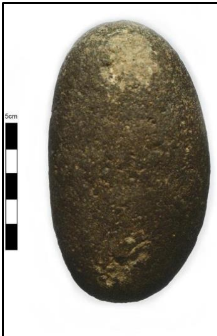
Photograph 18 - Hammerstone with pitting/pecking damage at both ends.