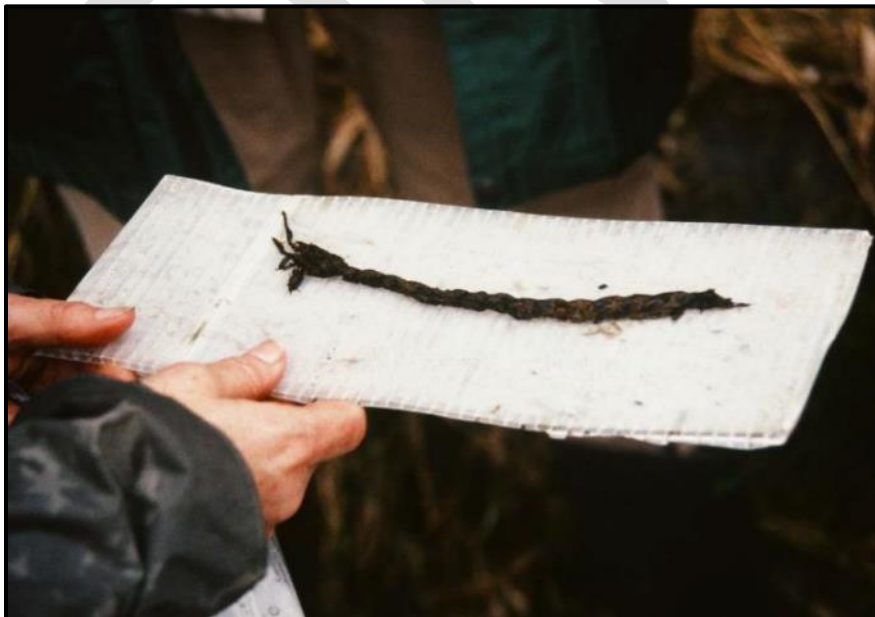
Photograph 11 - Waterlogged cordage (rope) fragment from the Fraser Valley.