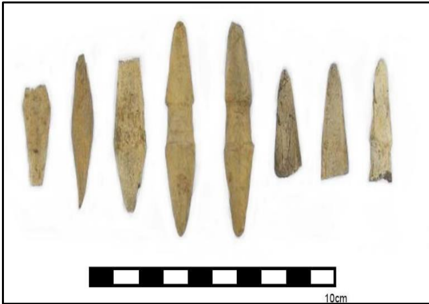
Photograph 27 - Toggling harpoon valves.