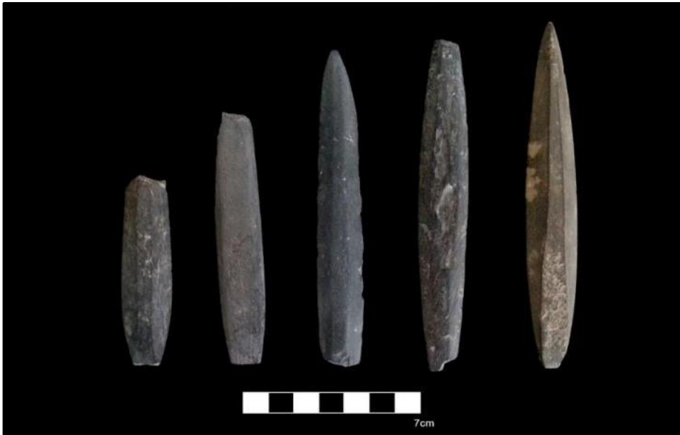
Photograph 16 - Ground slate projectile points and projectile point fragments.