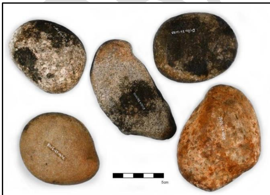
Photograph 30 - Natural pebbles coated in pigment, including ochre, recovered from an Indigenous village site in the Fraser Valley.