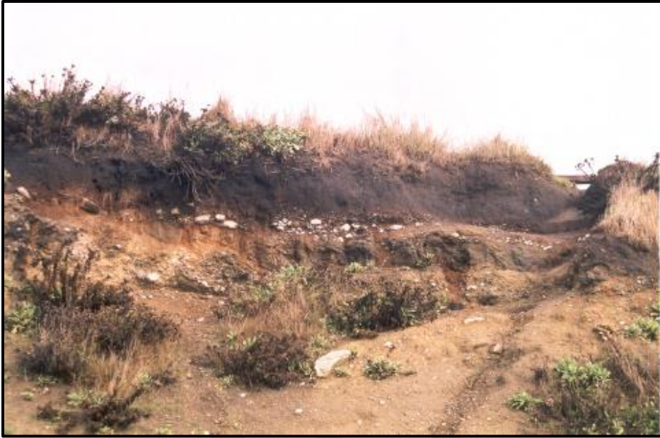
Photograph 3: Dark earth site, Vancouver Island.

Cultural accumulations of charcoal, ash, and other debris. Dark earth sites result from repeated burning events (e.g., vegetation clearing, food processing) and the successive deposition of food remains and general refuse. The BC Archaeology Branch refers to these as non-shell middens. Dark earth sites may contain ancestral human remains. Look for: dense accumulations of carbon-rich matrix, possibly mixed with fire-cracked rock, food remains (i.e., fish bones) and traces of shell (Photograph 3).