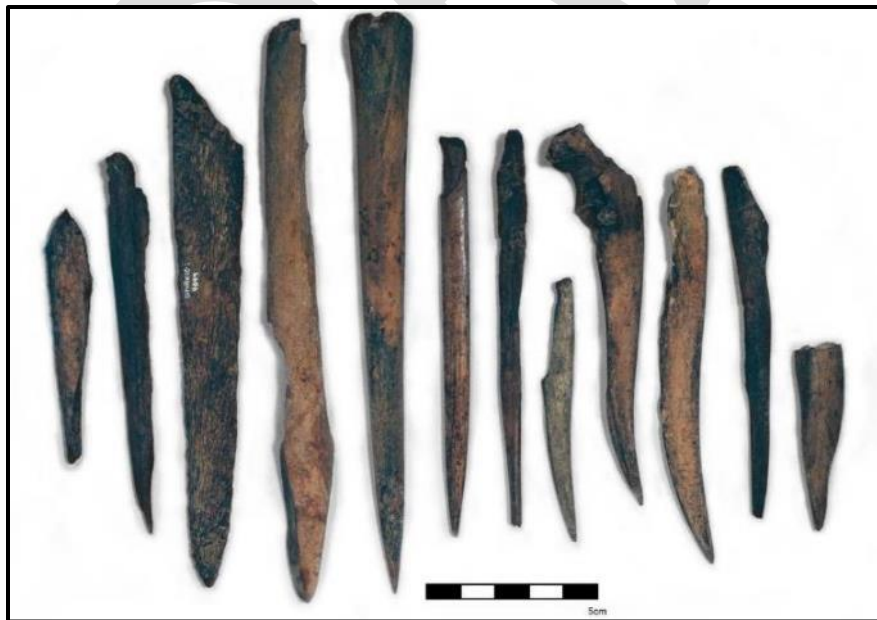
Photograph 24 - Bone awls (© Golder Associates Ltd.).