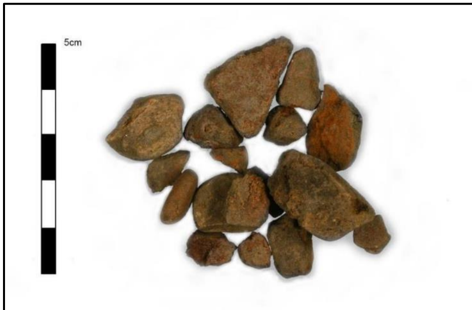
Photograph 29 - Ochre nodules recovered from an Indigenous village site in the Fraser Valley.

Ochre, also known as hematite, is a naturally occurring pigment which has significant spiritual importance for First Nations in the Metro Vancouver area. Similar to human remains, the presence of ochre (Photograph 29) or ochre-covered artifacts (Photograph 30) is extremely sensitive and needs to be treated with extra care and respect and may require special handling by cultural specialists. Look for: nodules of reddish orange-brown pigment and objects that appear to have been painted (matte-finish).