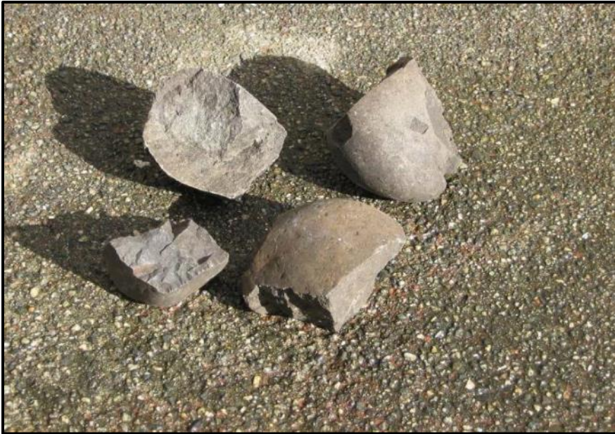
Photograph 6 - Fire-cracked rock, Vancouver Island. Note the angular nature of the breakage pattern and evidence of exposure to fire (© Andrew Mason).