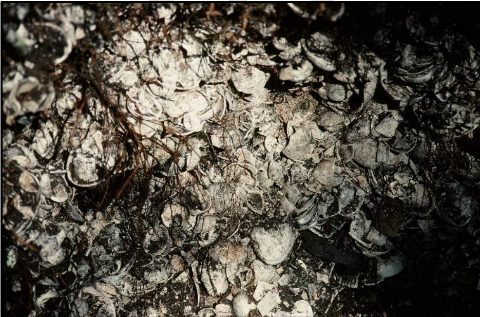
Photograph 2: Typical exposure of shell-rich midden deposits, Vancouver Island. (© Andrew Mason).