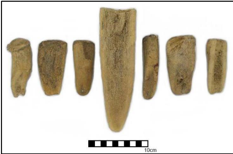
Photograph 25 - Antler tine wedges.