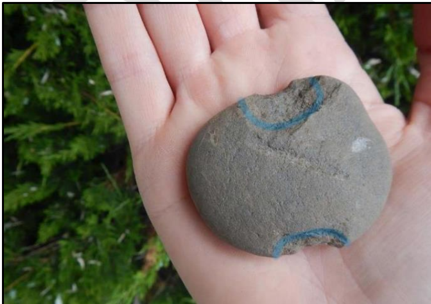
Photograph 21 - Pecked stone net weights.

Cobbles with their midsection pecked away to facilitate the attachment of a line were used as net weights (Photograph 21).