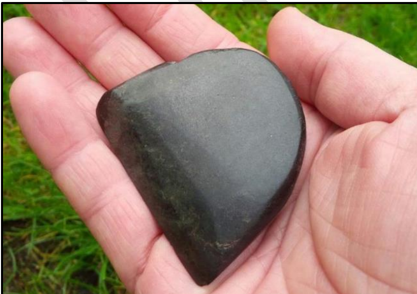
Photograph 9 - Nephrite (BC jade) adze blade from Vancouver Island.