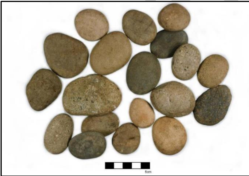
Photograph 7 - Pebbles, likely heated and used to boil water, recovered from hearth feature, Fraser Valley.