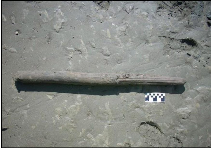
Photograph 12 - Waterlogged stake remnant recovered from the South Arm of the Fraser River in Delta. Note the sharpened tip to the right of the scale bar. Roughly 15 cm of the stake was found protruding from river silts.