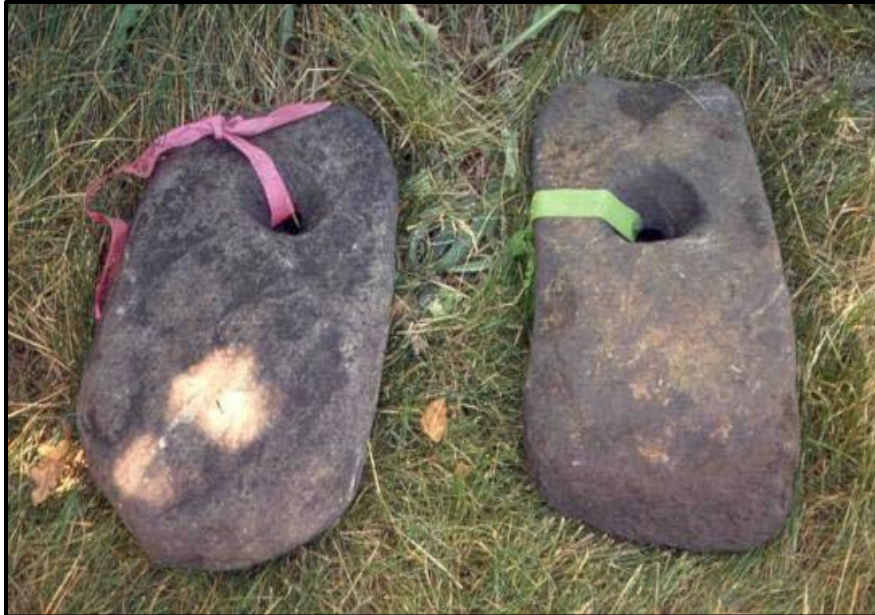
Photograph 20 - Stone anchors.

Large stones with holes perforated to attach lines were used as anchors (Photograph 20), perhaps for fishing gear or watercraft.