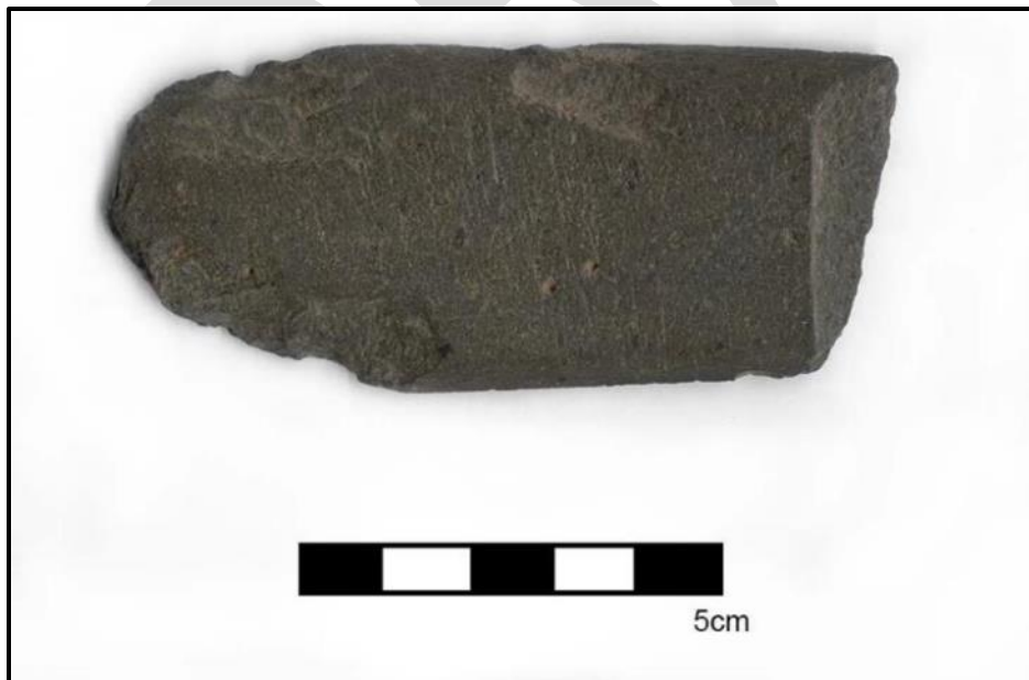
Photograph 15 - Ground slate knife fragment.

Some stone artifacts were manufactured by grinding rather than chipping (Photographs 15 to 17). These objects are typically made from slate or a related material. Given the greater fragility of the raw material, ground stone artifacts are often fragmentary.