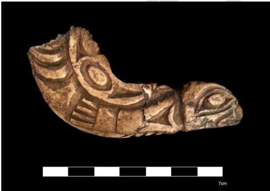
Photograph 28 - Incised bone decorative piece, likely representing a seal.