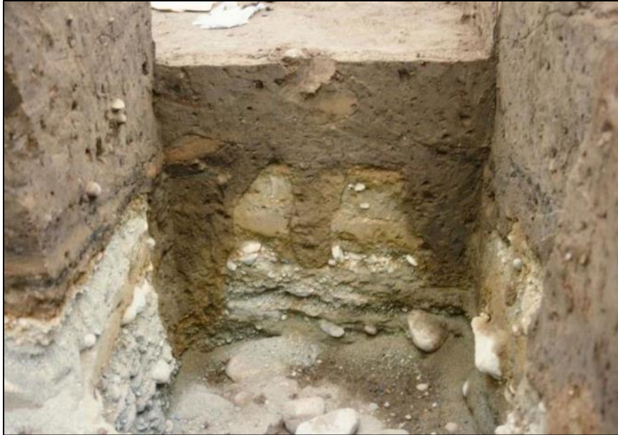
Photograph 4 - Three post mold features extending into sterile gravel deposits exposed in an excavation wall profile, Fraser Valley.

Post mold features (Photograph 4) are the archaeological signature of structural supports for dwellings, fish drying racks, etc., and represent soil-filled voids that are left when the wooden supports deteriorate with the passage of time. Features of this type are typically found in cut bank exposures (e.g., ditches, excavation walls) and are often associated with other archaeological features and objects (e.g., house floors, hearths, etc.).