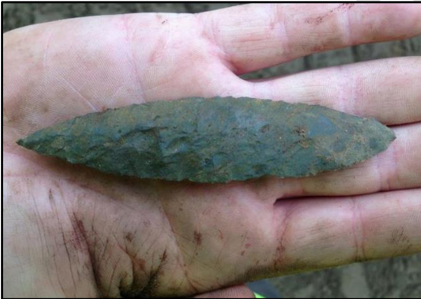
Photograph 8 – Leaf-shaped projectile point recovered in the Fraser Canyon.

This chance find procedure document includes a number of images of artifact types, several of which could be encountered as an “isolated find.” Photographs 8 and 9 illustrate artifact types that are often recognized by the public and brought to museums. Look for: formed objects of stone, bone, antler, or shell that do not appear natural or are composed of a raw material (e.g., stone) that is not common or native to Metro Vancouver.