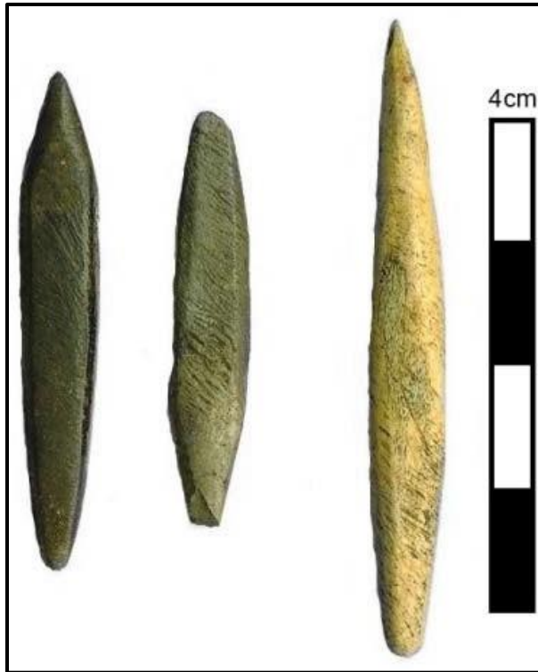
Photograph 23 - Bone bipoints.

Indigenous peoples in the Metro Vancouver area made extensive use of bone and antler for the manufacture of both expedient and curated objects (Photographs 23 to 28). Look for: bone and antler artifacts exhibiting obvious modification (e.g., cutting, shaping, incision).