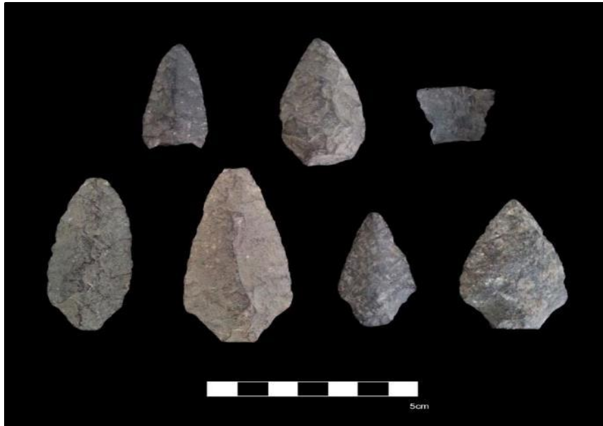
Photograph 14 - Projectile points and projectile point fragments (© Golder Associates Ltd.).