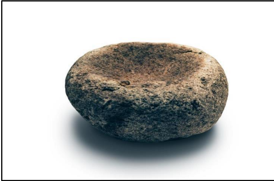
Photograph 22 - Pecked stone bowl.

Pecked stone bowls are occasionally found in archaeological sites or as isolated finds. Similar to hand mauls, they represent a significant investment in labour to create and would likely have been handed down from person to person and generation to generation. Some examples are plain (Photograph 22), whereas others may be highly complex with figures pecked in relief.