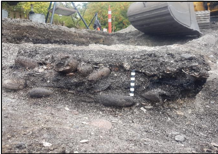
Photograph 5 – Cross section of a hearth feature composed of charcoal and ash with fire-cracked rock, Crescent Beach.

Hearth features (Photograph 5) are typically the remains of cooking fires, and consist of concentrations of charcoal, ash, and fire-reddened soil. These features may contain small bone fragments and heat-fractured stone (Photograph 6) or small, uniform-sized pebbles that were heated and used to boil water (Photograph 7). Hearth features found in large, circular pits— particularly on the beach—may represent steaming pits for processing foods (e.g., bulbs). Hearth and steaming pit features are typically found near village sites or camps. Look for: concentrations of charcoal and fractured pebbles with signs of having been burnt in a fire.