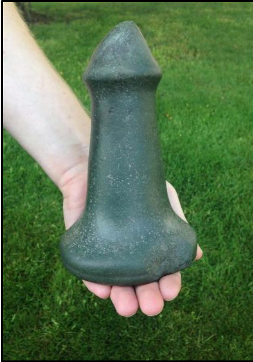
Photograph 19 - Phallic form hand maul

Hand mauls, or stone hammers, are found in Metro Vancouver archaeological sites dating from the past 5,500 years and likely represent a coveted tool given the great many hours that would have been required to manufacture each piece. The form of hand mauls tend to vary through time and can range from a basic flat top to more elaborate phallic forms (Photograph 19). It is not uncommon to recover fragmentary hand mauls from sites.