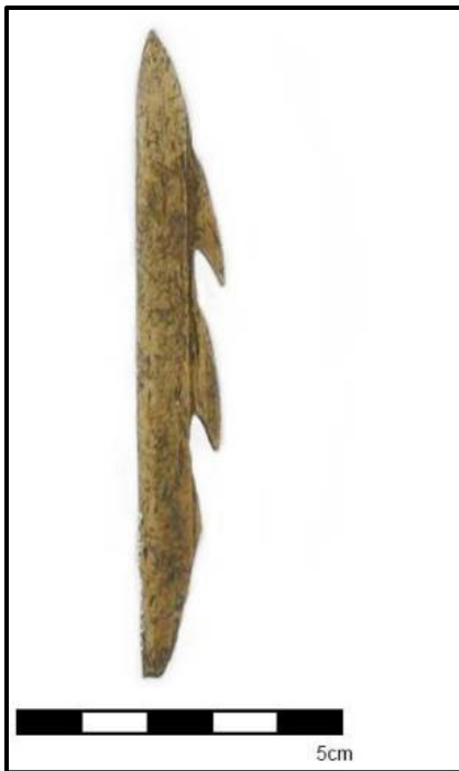
Photograph 26 - Barbed harpoon.