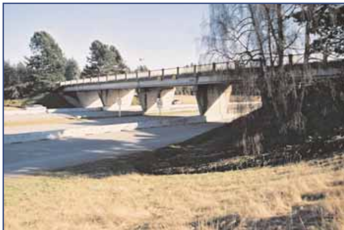
North Side of Highway 99 Underpass (facing southeast) where a new bridge will be constructed on the south side of the existing structure.