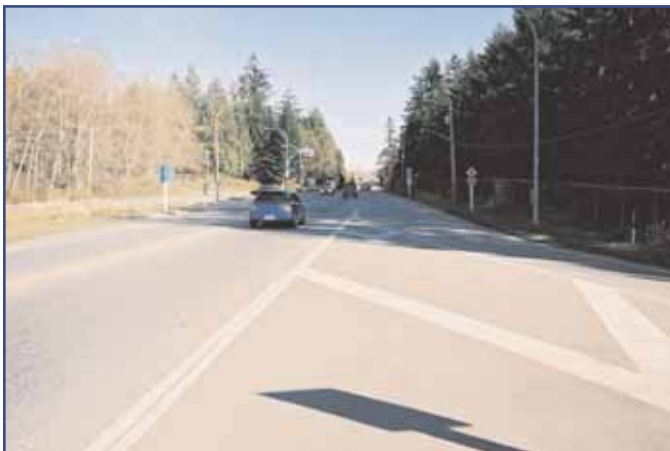
8th Avenue Facing East at Highway 99 Northbound Off-Ramp (Proposed location of two-lane widening)