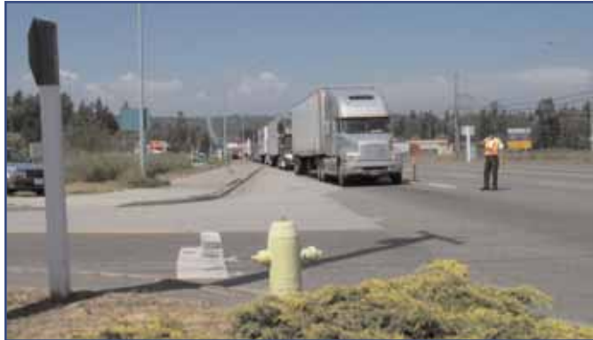
2nd Avenue Intersection

The four photographs here illustrate the border congestion and inefficiency of the current infrastructure.