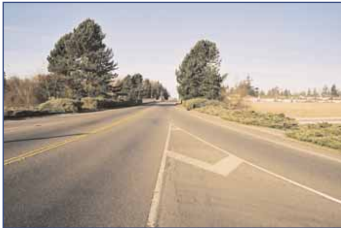
8th Avenue Facing West at Highway 99 Underpass (Location of proposed east side roundabout and relocation of overpass).