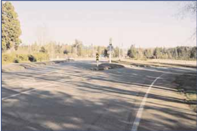
8th Avenue Facing Eastbound at Highway 99 Southbound On-Ramp (Proposed West Side Roundabout)