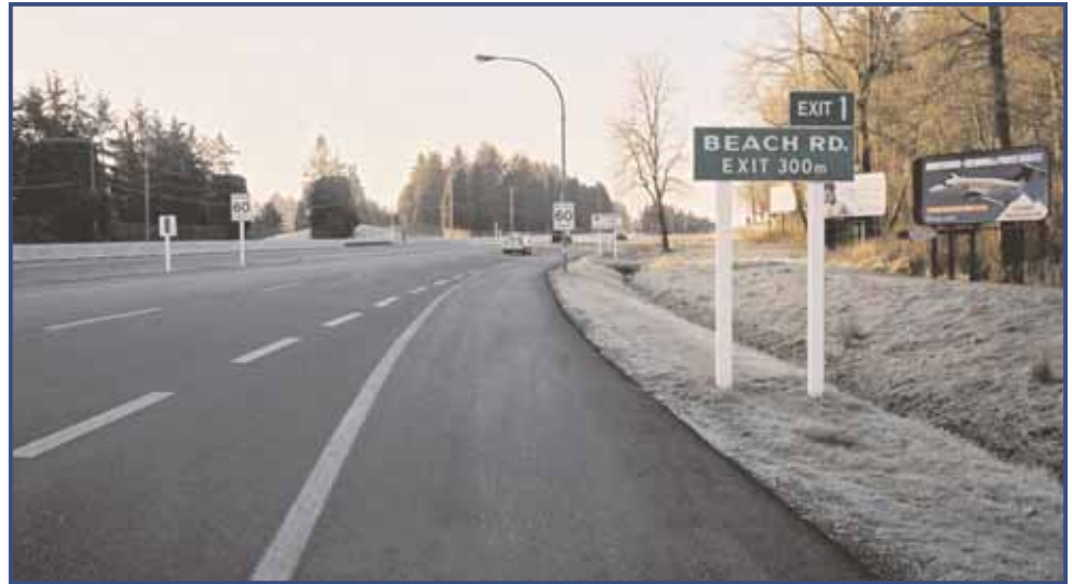
Highway 99, facing south, location of proposed NEXUS Lane

The project entails the extension of the existing dedicated commuter lane on Highway 99 southbound by approximately 700 metres, to be used by pre-approved NEXUS registered drivers.