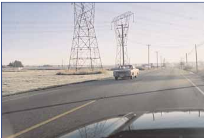
8th Avenue Facing East at B.C. Hydro's Transmission Line Crossing (Two 500 kV B.C. Hydro Lines to the USA and Telus Lines where lateral clearance requirements exist)