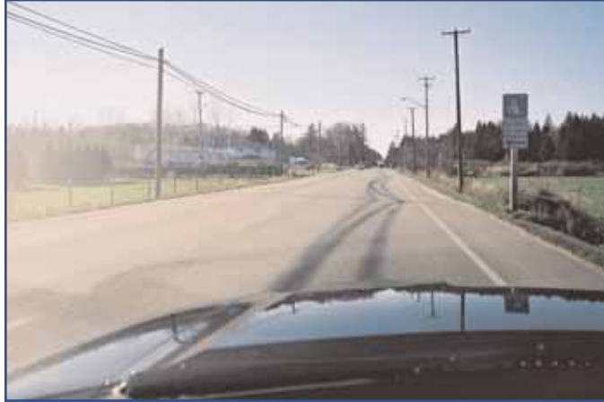
8th Avenue Facing West at 172nd Street Intersection/ Access to Peace Portal Golf Course, where ditch relocations are required for Widening.