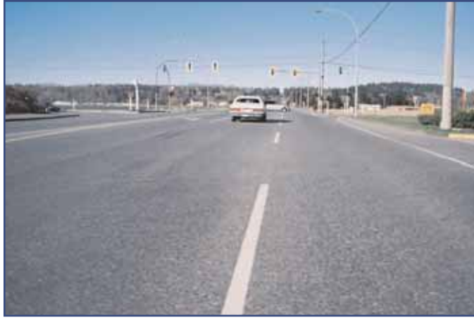
Highway 15 Facing North at 8th Avenue where improvements will be coordinated with ATIS project and ITS/CVO Truck [FAST] System Enhancements