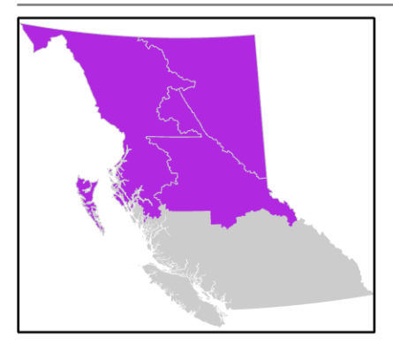
Health Service Delivery Area (HSDA)