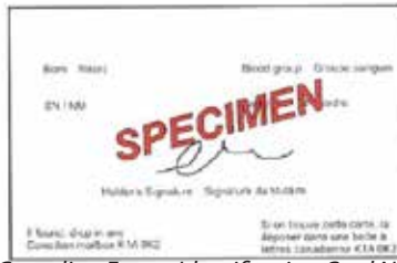
Canadian Forces Identification Card NDI