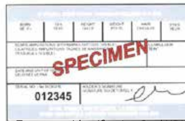
Temporary Identification Card NDI