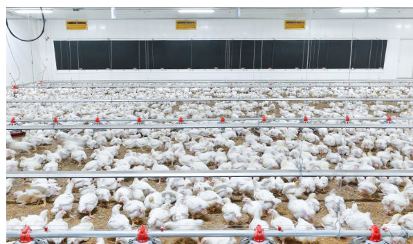
8 week old broilers in a barn.

The Consumer Price Index (CPI) for fresh and frozen chicken averaged 169.8 in 2020, up 5.4 points from 2019. All meat CPI's except for turkey experienced significant increases in 2020.